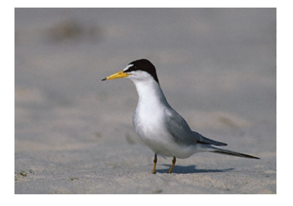
Efforts to enhance and protect beach nesting areas and habitats have resulted in a marked increase in the number of Least Tern nesting pairs on the base.