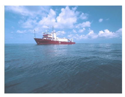
The Navy conducts surveys of sea turtles and marine mammals before, during and after testing and training exercises.