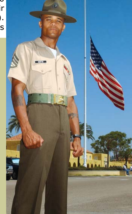
SPECIAL DUTY ASSIGNMENTS CAN BE CHALLENGING AND MAY SERVE AS A TOOL FOR CAREER ENHANCEMENT

recommend talking with the PMOS monitor to find out billets what are available and when. There are also situations where would be wiser to remain in the PMOS establish MOS credibility for a year more before or seeking an SDA due competition for promotion. Marines should consider when they may be in-zone for selection to the next grade at the time they are considering SDA. Again, remaining proactive with career decisions will allow Marines to best manage their career paths and ensure success.