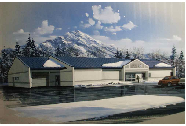
The West Coast & Alaska Tsunami Warning Center Palmer, Alaska

nami is evaluated as having the potential to be dangerous to Alaska and the West Coast, the ADVISORY will ultimately be upgraded to a WATCH or WARNING as the wave approaches the U.S. coastal areas.