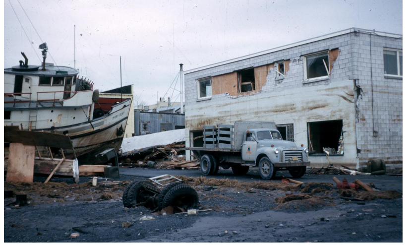
Kodiak, Alaska 1964

West Coast & Alaska Tsunami Warning Center