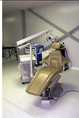
Dental care is provided at the detainee hospital at Camp Delta.