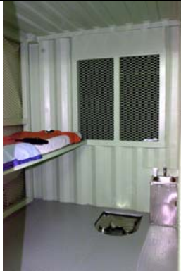
A detention unit at Camp Delta, Guantanamo Bay, Cuba.