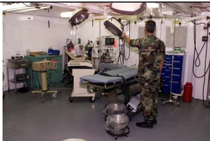
The operating room at the detainee hospital at Camp Delta, Guantanamo Bay.