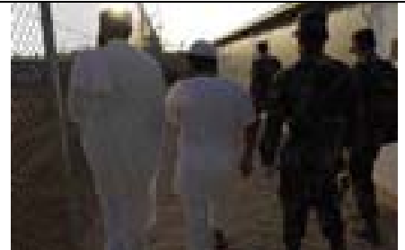
Two detainees are escorted to a medium security facility at Guantanamo Bay, Cuba.