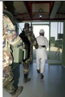
A detainee is escorted to a medium security facility at Guantanamo Bay, Cuba.