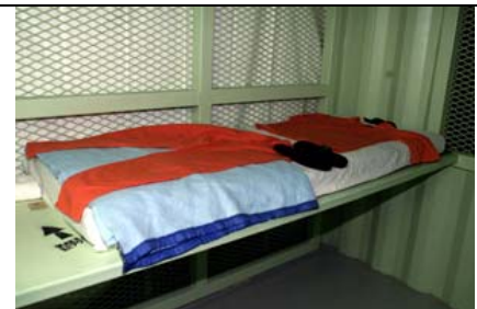
Comfort items issued to detainees at Camp Delta, Guantanamo Bay, Cuba.