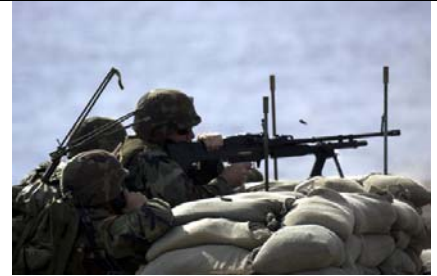
A sailor fires a M-60 machine gun during live-fire exercise at Guantanamo Bay, Cuba.