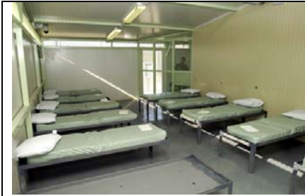
Bunks in a medium security facility await the arrival of detainees at Guantanamo Bay, Cuba.