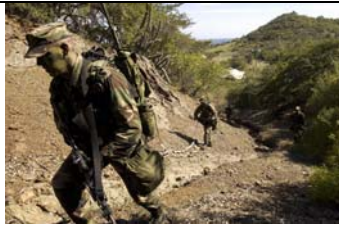
U.S. Army soldiers conduct a dismounted patrol in Guantanamo Bay, Cuba.