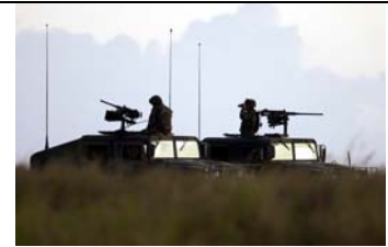
A U.S. Army soldier uses binoculars to scan the perimeter of the Leeward Airfield at Guantanamo Bay, Cuba.