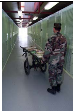
A librarian pushes a book cart at Camp Delta, Guantanamo Bay, Cuba.