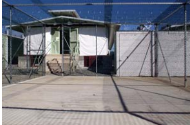
A Camp Delta recreation and exercise area at Guantanamo Bay, Cuba.

These photos from inside Camp Delta have been approved for Public Release. They can be found online at http://www.dod.mil/photos/Operations/OperatiEndurinFreedo .