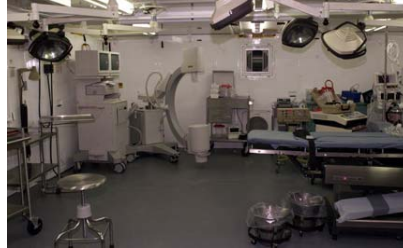
The operating room at the detainee hospital at Camp Delta.