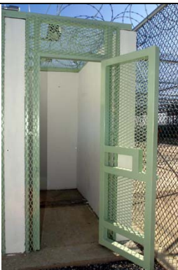
A single, outside shower stall at Camp Delta.