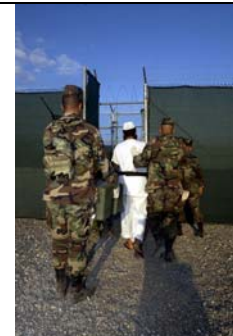
A detainee is escorted to a medium security facility at Guantanamo Bay.