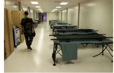
The detainee hospital ward at Camp Delta, Guantanamo Bay, Cuba.