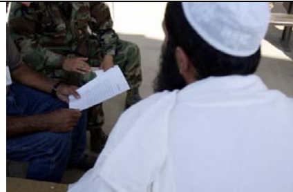
The detainee leader for a medium security facility is read the camp rules at Guantanamo Bay.