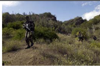
Army soldiers conduct a dismounted patrol in Guantanamo Bay.