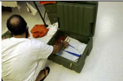
A detainee packs his personal belongings prior to being relocated to a medium security facility at Guantanamo Bay.