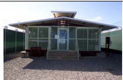
A forty-eight-person detention block at Camp Delta, Guantanamo Bay.