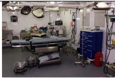
The operating room at the detainee hospital at Camp Delta.