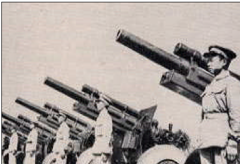
Below: Chinese Communist artillery unit equipped with made in USA M2A1 105mm howitzers captured during China's civil war. The Chinese army in Korea principally used captured U.S. and Japanese weapons but received a steady stream of Soviet-built artillery throughout the war. (DA Pamphlet 30-51, Handbook on the Chinese Communist Army, Sep 52)