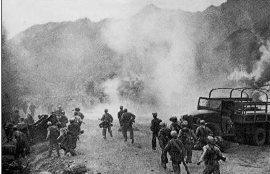
Above: Chinese troops with trucks and 105mm guns of the 1st Cavalry Division or Republic of Korea II Corps in the Unsan area. This photo was probably staged since all or most lost artillery was overrun between 27 Oct and 2 Nov 50 in actions that occurred in early morning darkness. (DA Pamphlet, 1955)