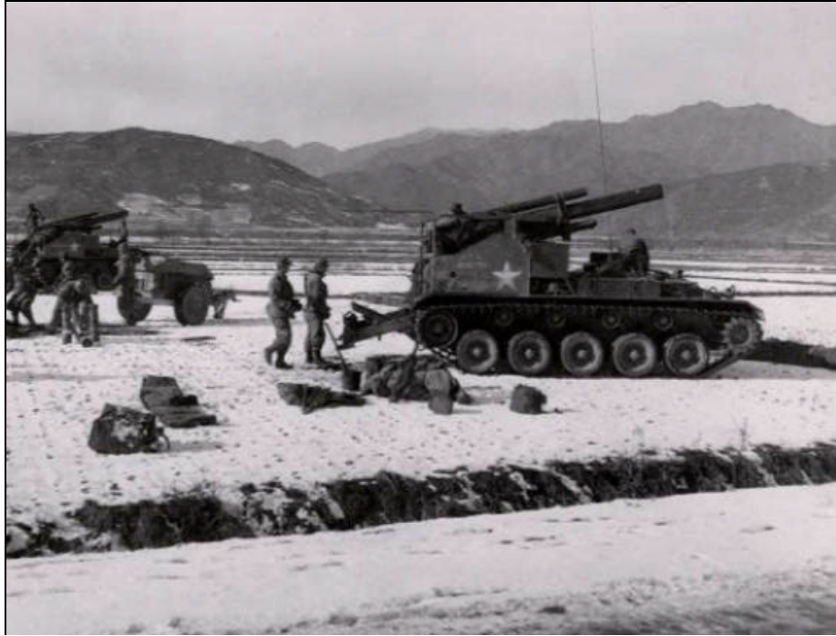
7th Infantry Division 155mm self-propelled howitzers near Sinhung protect the perimeter around the seaport city of Hamhung during the withdrawal of the 1 st Marine Division from the Chosin Reservoir. (U.S. Army, 2 Dec 50)

105mm howitzers fell into Chinese hands with little or no damage and were not destroyed by subsequent air strikes. The North Koreans had little interest in the American-made artillery when they overran much of the South the previous summer because their Army was a totally Soviet-equipped and supplied force. 47 However, the mainstays of Chinese field artillery in 1950 were Japanese 75mm field guns and 105mm howitzers and guns, Soviet 76mm guns, and the “made in USA” 105mm. 48 For obvious reasons, the Chinese were more than happy to add the captured weapons to their inventory.