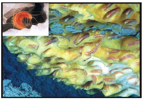
The iceworm (Hesiocaeca methanicola)

In addition to furthering the general objectives of CHEMO I, CHEMO II investigated the sources (e.g., deep vs. shallow or petrogenic vs. biogenic) of any necessary dissolved gases and the likelihood that petroleum production may ultimately deprive the animals of an energy source; the age, growth rate, turnover rates, reproduction and recruitment; the