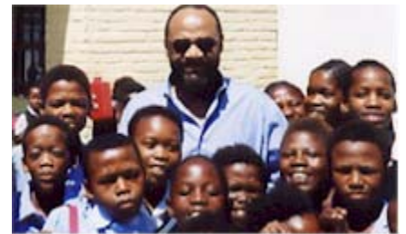
Under Secretary Bost visits with school children in South Africa