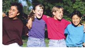
Junior or Middle School Grades 6 to 8 Youth Ages 11 to 13