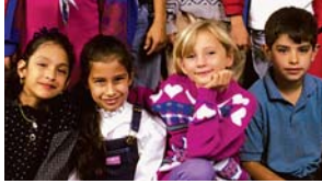
Elementary or Primary School Kindergarten and Grades 1 to 5 Children Ages 5 to 10