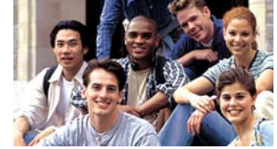
Postsecondary or Higher Education, Public and Private Community Colleges, 2-year or 4-year Colleges or Universities, Trade Schools All Adults May Attend

One of the first things you should do is enroll your child in school. Some questions that parents often ask include: