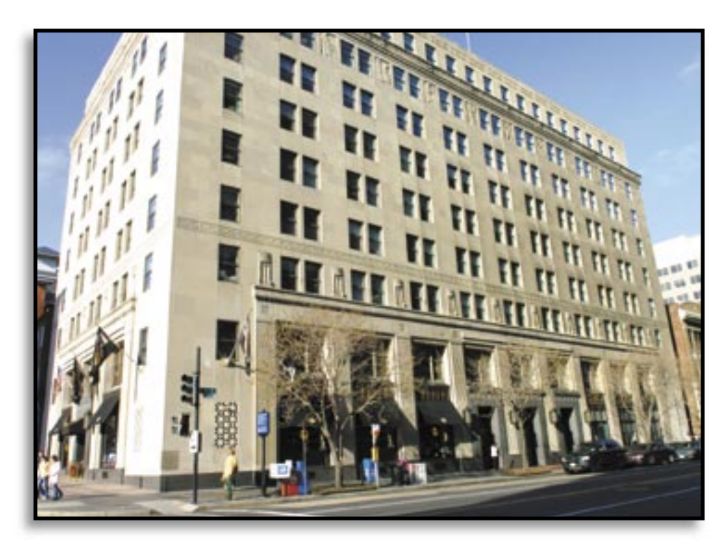
FEC Building in downtown Washington, D.C.