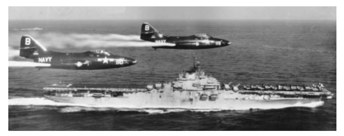
F9F Panther jets dump reserve fuel before landing on Princeton upon return from air strike over Korea 429191