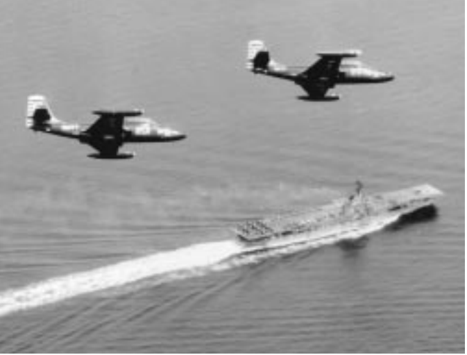
F2Hs en route to target pass Lake Champlain 630627