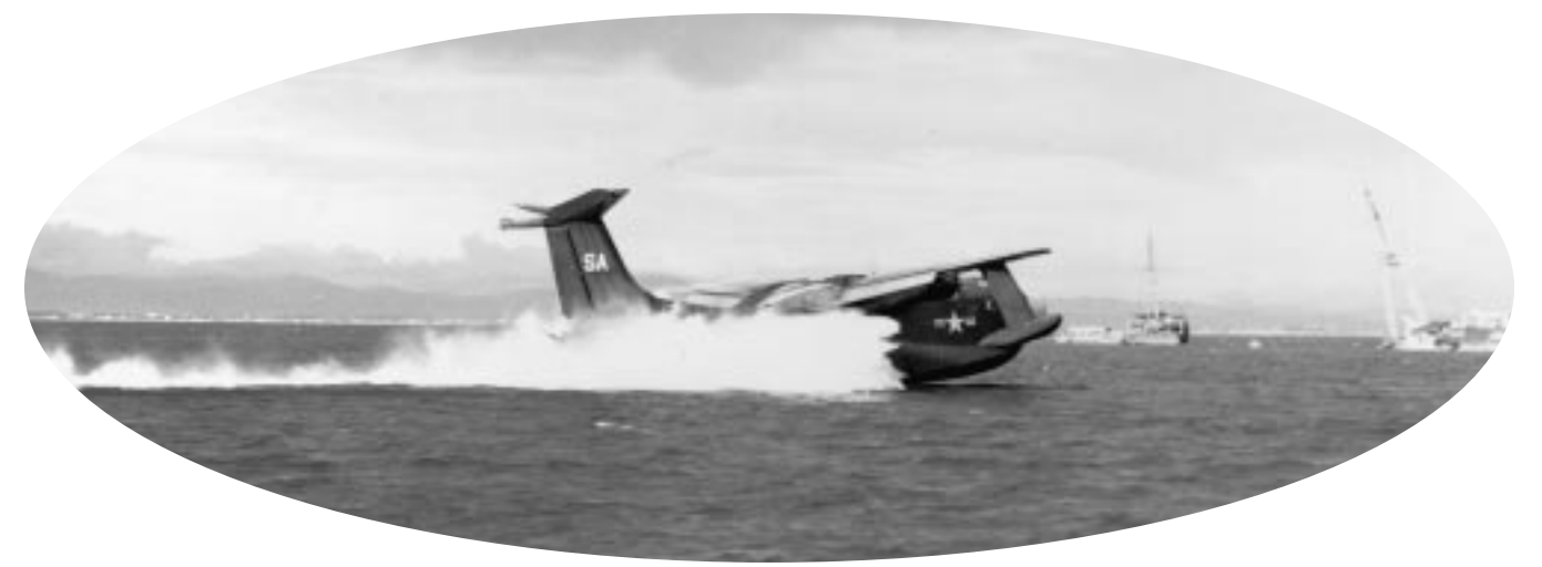
At the end of a patrol flight a P5M-2 Martin Marlin sets down at NAS Sangley Point in the Philippine Islands 676502