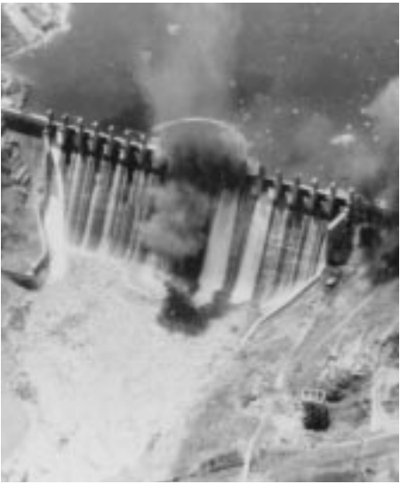
ADs destroy Hwachon Dam in only aerial torpedo in use in Korea 428678

8–15 April When reports indicated the possibility of an amphibious attempt on Formosa from the China coast, Task Force 77 left the Korean area temporarily to make a show of strength in the Formosa Strait. From 11 to 14 April the force steamed off the China coast and flew aerial parades outside the international limit off the mainland.