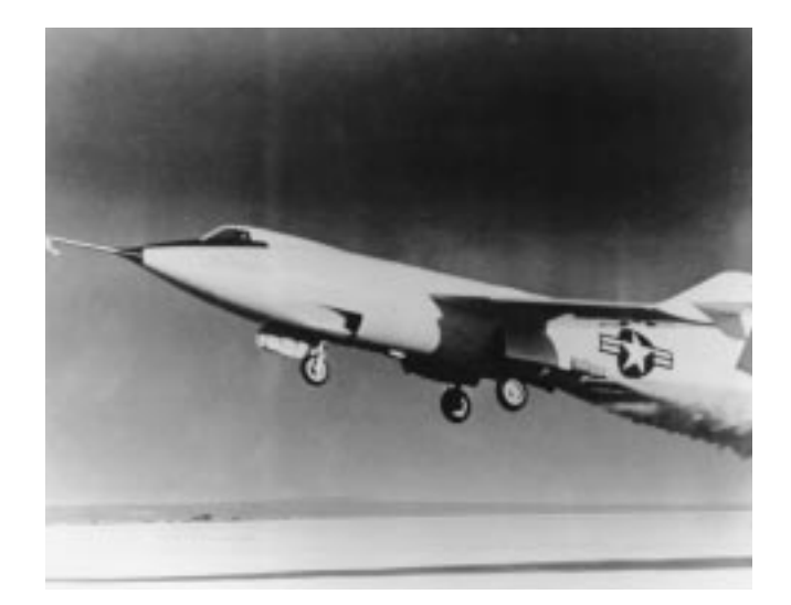
D-558-2, high speed research aircraft in which LtCol. Marion E. Carl made flights at 1,143 mph and 83,235 feet 651837

27 July United Nations and Communist representatives signed an armistice at Panmunjom, bringing hostilities to a halt in Korea.