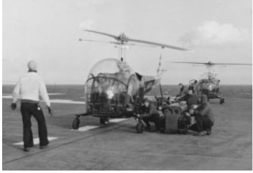
HTLs preparing to takeoff from Valley Forge in western Pacific 424772