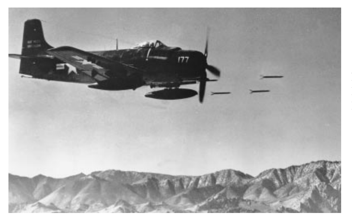
An AD Skyraider test fires the Mighty Mouse, a high speed long-range air-to-air rocket, at NOTS Inyokern 707573