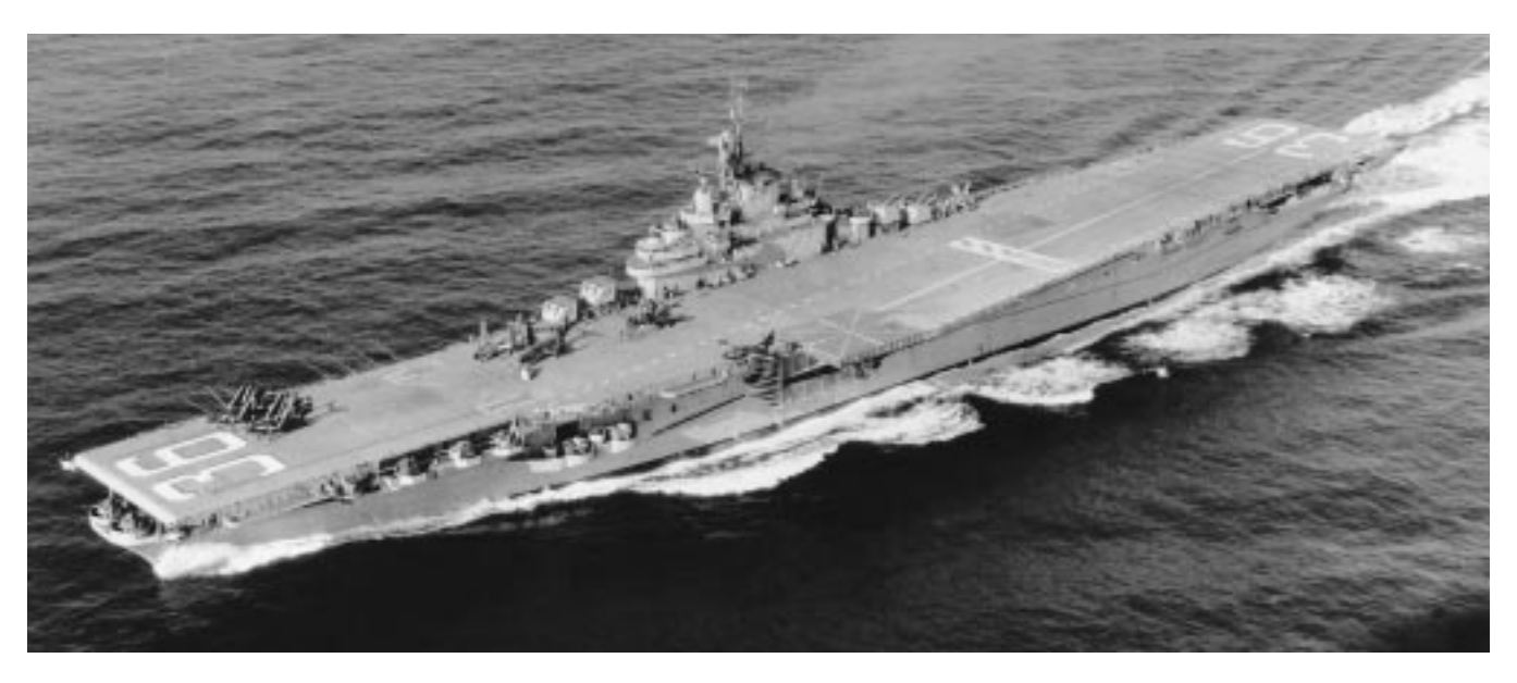
F9F Panther takes off from Antietam during the operational suitability tests of angled flight deck 477063

12 January In the initiation of test operations aboard the Navy's first angled deck carrier, Antietam ,