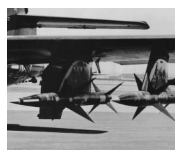
Sparrow I air-to-air missiles on wing of F3D 1023526

ment of bombing highways and lines of communication in northeast Korea, its responsibilities for interdiction would occupy a major share of its attention until the end of the war.