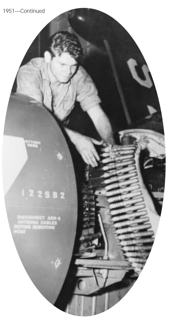
Arming F9Fs 20mm guns 1030116

12 June Two PB4Y-2s of VP-772 were transferred from NAS Atsugi, Japan, to Pusan, South Korea, to fly flare dropping missions for Marine Corps night attack aircraft. The success of the operation, which was conducted as an experiment, was such that the practice of assigning specially equipped patrol aircraft for this purpose was continued.