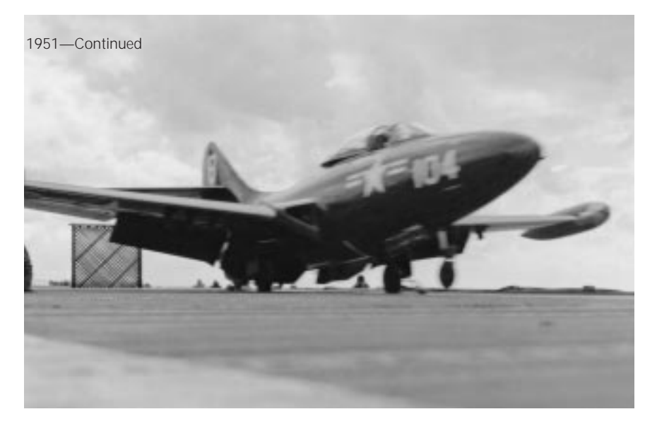
Deflector diverts jet exhaust on F9F takeoff 423763