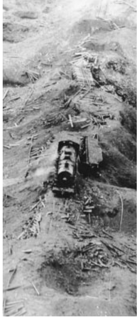
Locomotive, but no railroad 1053760