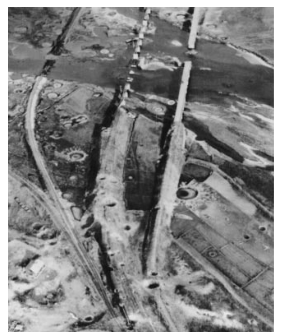
Interdiction. Repeated attacks denied railroad to stubborn foe 1053759