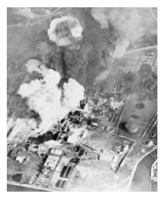
Wonsan refinery after carrier strike 707876

the Yellow Sea, in operations intended to relieve the pressure on UN forces which were fighting a delaying action while withdrawing toward Pusan.