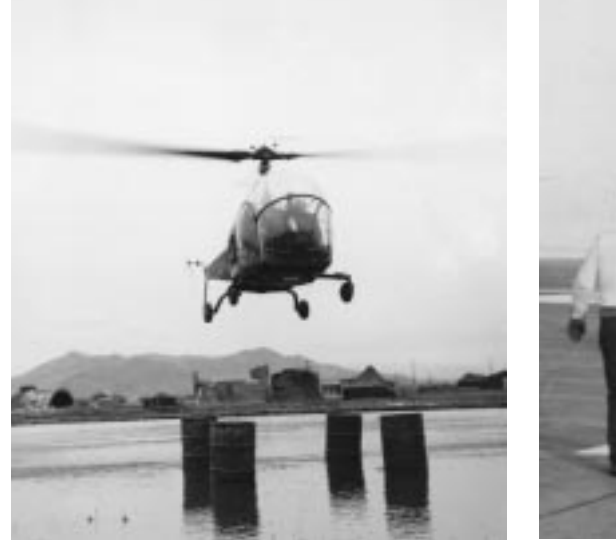
Landing in a rice paddy USMC 131109