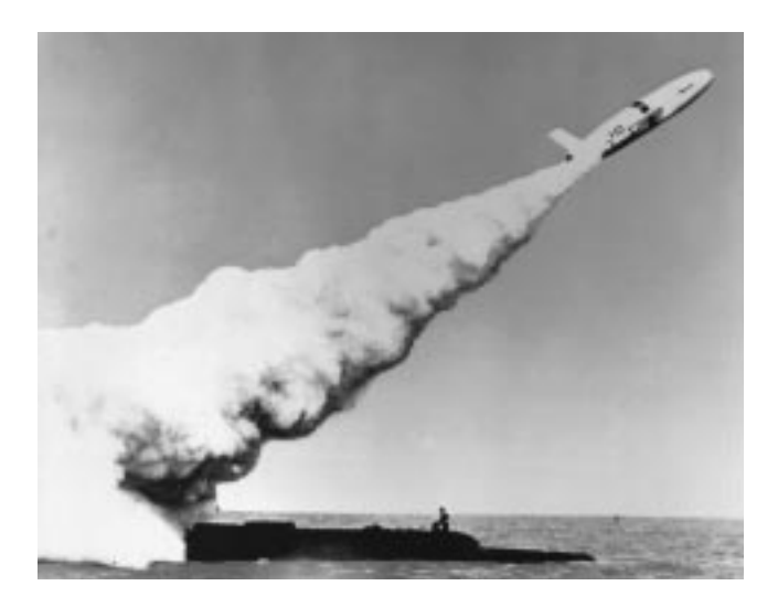
A submarine fires a Regulus I guided missile 636833