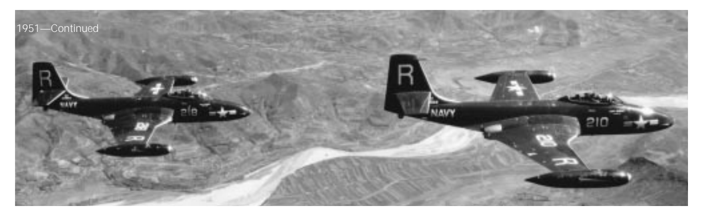
F2H Banshees from Essex seek out North Korean targets 433959

and supply missions for the First Marine Division. On 13 September it began its support of the First Marine Division with Operation Windmill I. In this initial combat test of transport helicopter capabilities, the squadron lifted one day's supplies for the First Marine Battalion on a seven-mile carry from its base to the forward area.