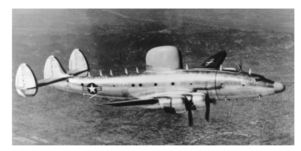
Early version of Lockheed WV, radar picket plane for longrange patrol, on seaward extension of Dewline 1053793