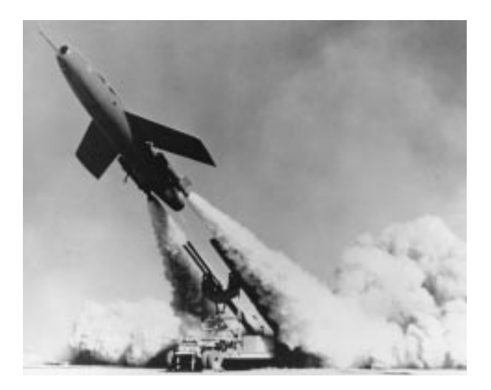
Test of Regulus I surface-to-surface missile, JATO launches Bird and main engine provide long range 1053792

2 April Two F9F-2B Panthers of VF-191, each loaded with four 250- and two 100-pound general-purpose bombs, were catapulted from Princeton for an attack on a railroad bridge near Songjin, North Korea. This was the first Navy use of a jet fighter as a bomber.