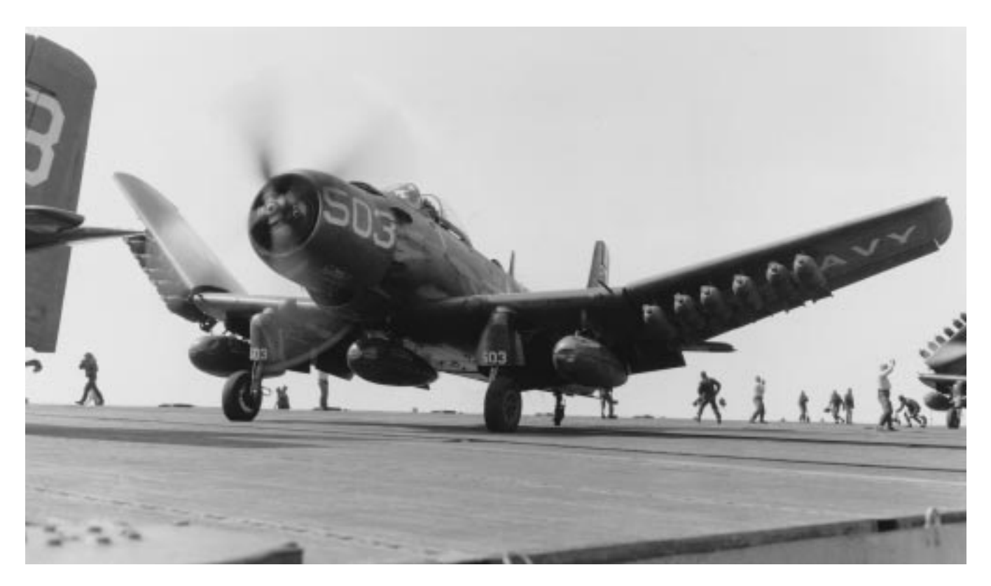
AD Skyraider prepares to take off on close support mission 428637