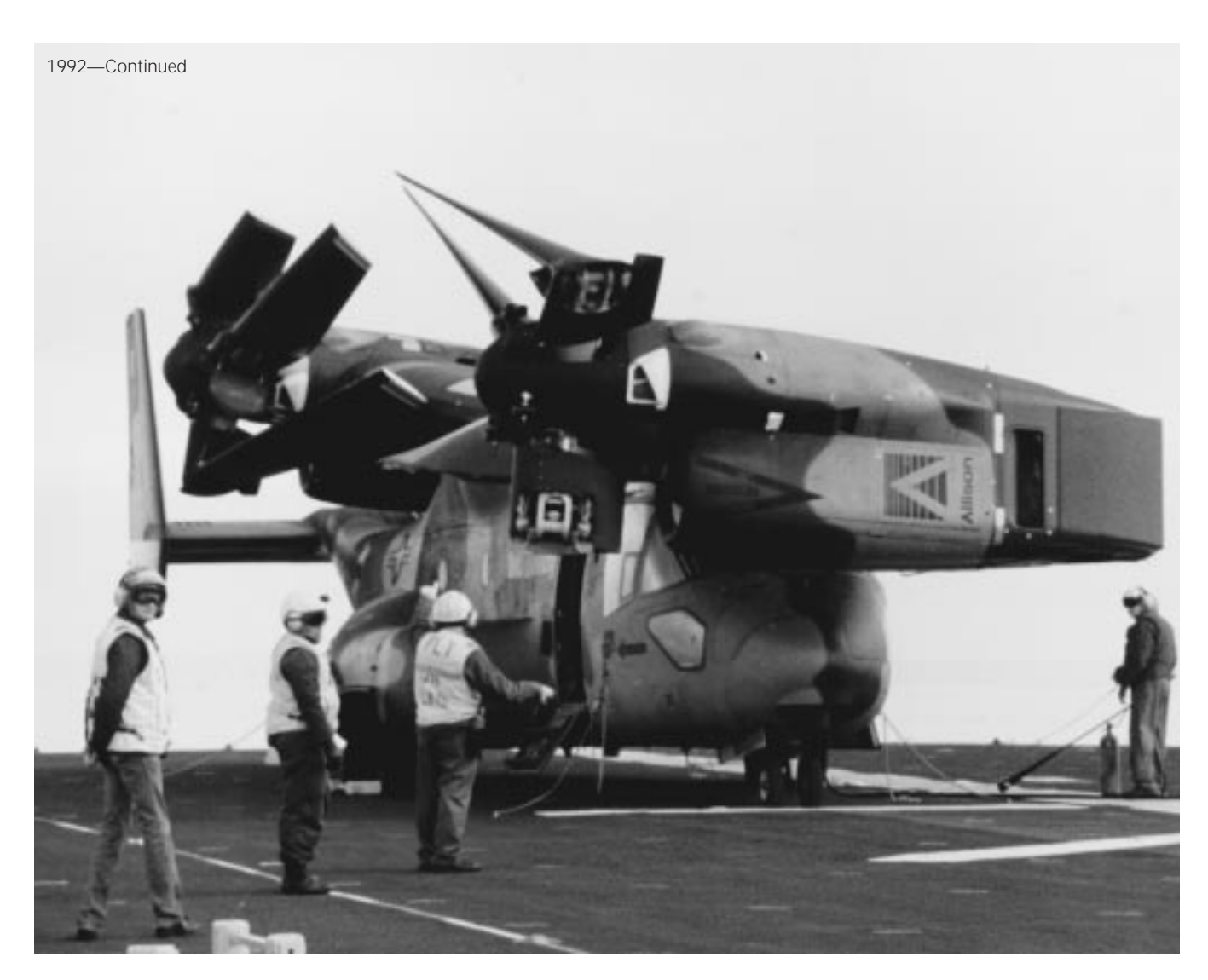
The complex wing and rotor folding arrangement of the MV-22A Osprey.