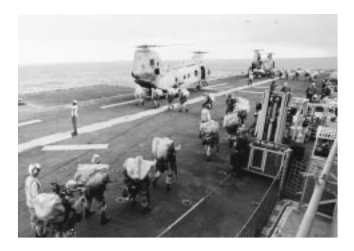
Marines prepared to embark a waiting CH-46E helo on Tripoli during early hours of Operation Restore Hope.

12 April NATO officials in conjunction with the UN began the enforcement of a "no-fly zone" over Bosnia-Herzegovina, known as Operation Deny Flight. NATO had proposed the "no-fly zone" to the UN Security Council, who passed Resolution 802. Twelve F/A-18 Hornet strike-fighter aircraft from CVW-8 embarked on Theodore Roosevelt were transferred to NATO in support of the operation. Other aircraft and ships from Theodore Roosevelt's battle group provided support. The Mediterranean ARG emarked on Saipan provided SAR/TRAP duties.