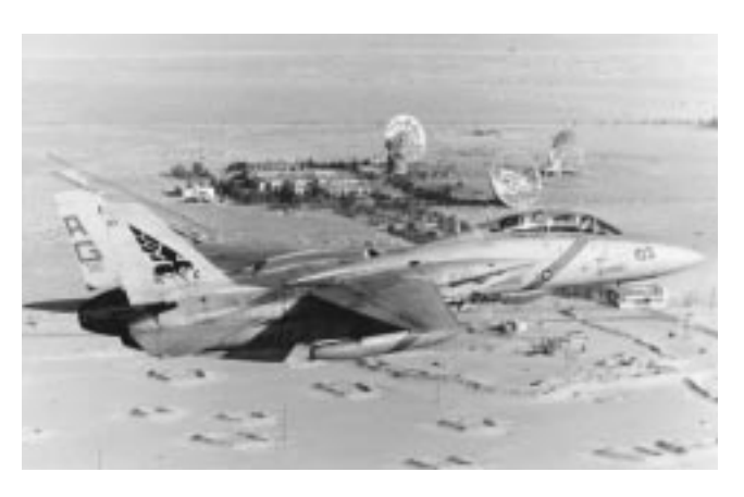
An F-14 Tomcat from VF-143 flies over a destroyed Iraqi radar site.

21 December The end of Operation Deny Flight was commemorated at Dal Molin Airport, Vincenza, Italy. Operation Deny Flight began in 1993 and provided air cover and close air support to UN Protection Forces' military operations, stopped the use of air power as an instrument of war in Bosnia-Herzegovina, and provided the firepower for air strikes in Operation Deliberate Force that contributed to the peace process.