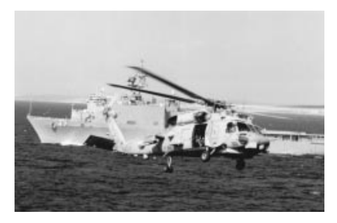
An SH-60B flies past Rushmore (LSD 47) off the coast of Somalia en route to Tripoli.