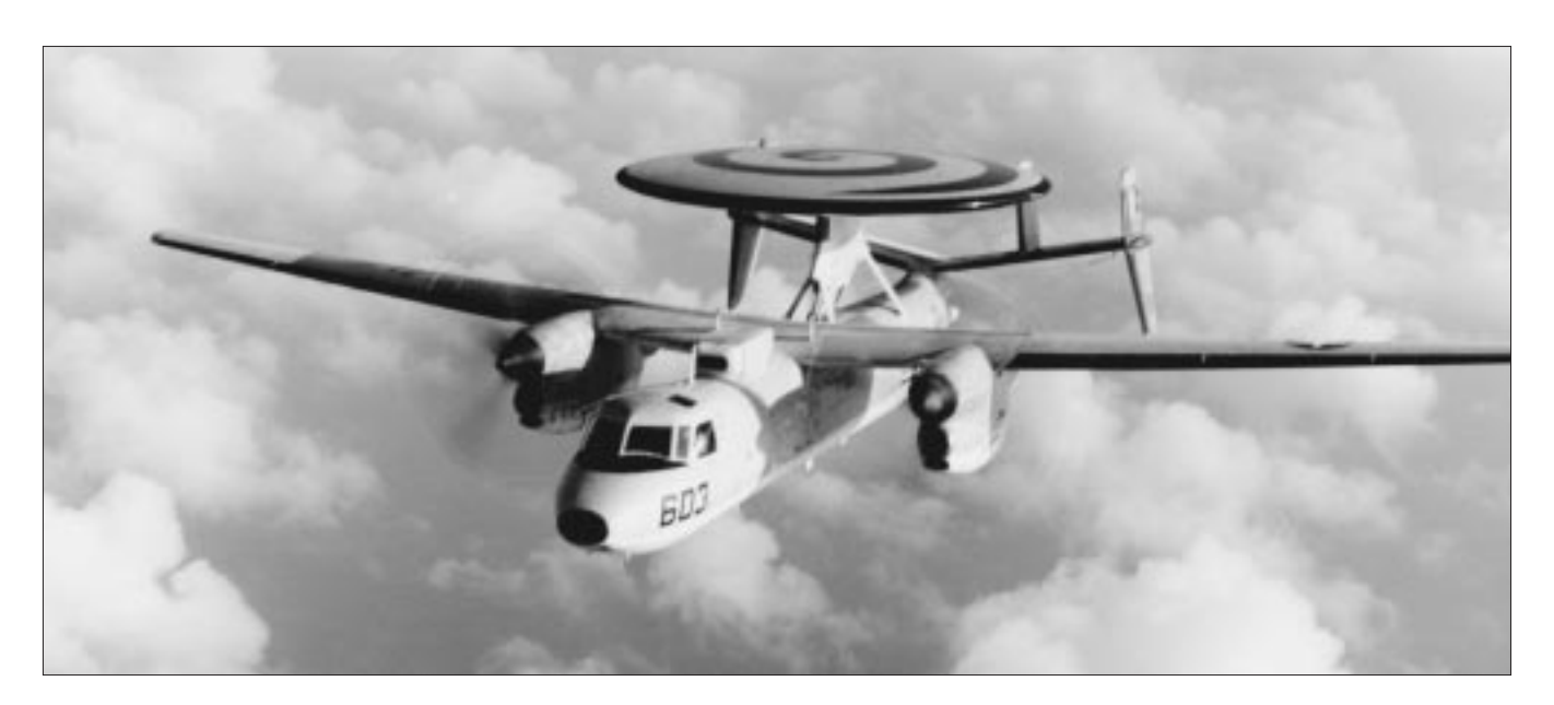
The eyes of the fleet, the E-2C Hawkeye.