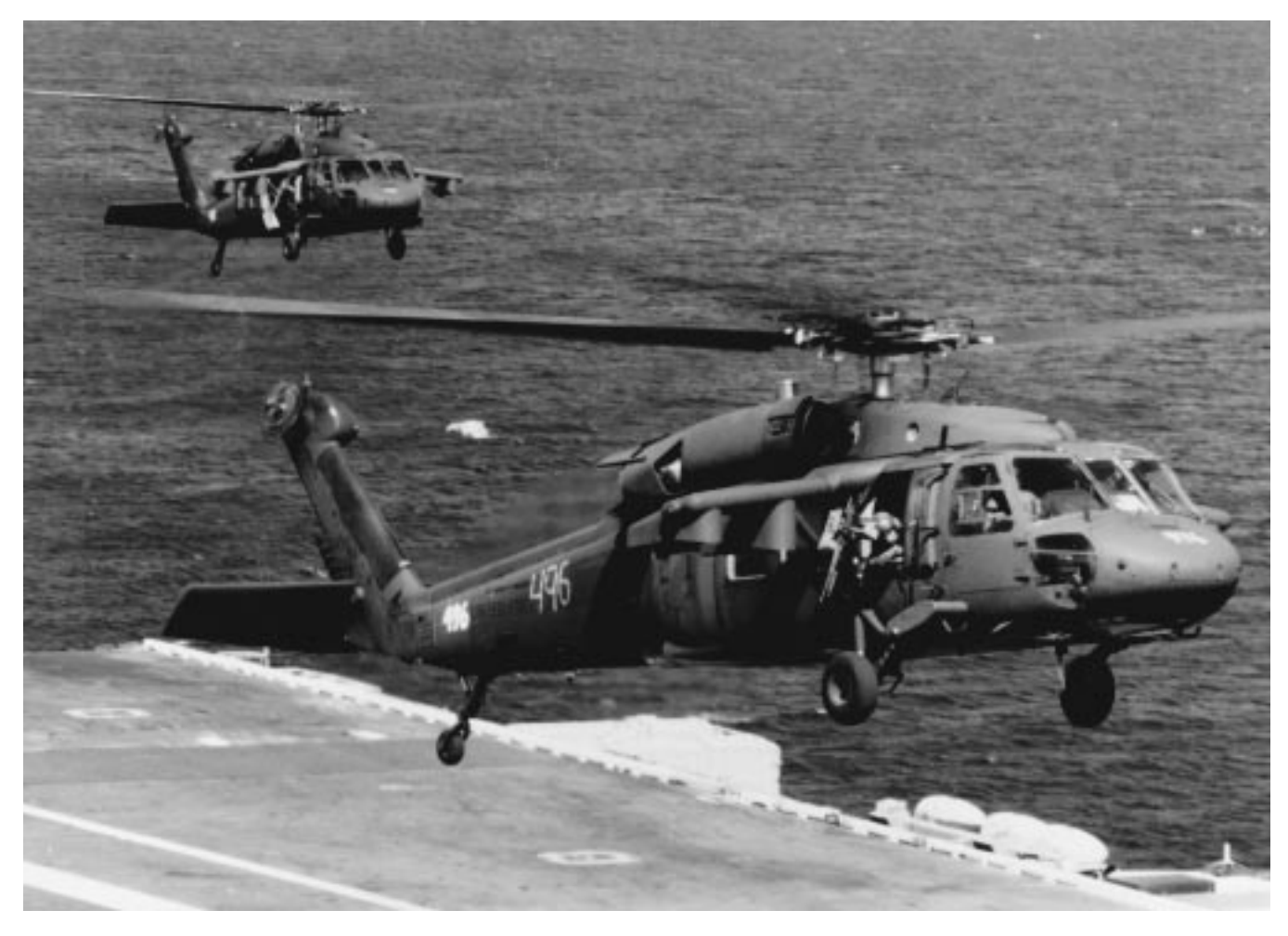
Army helos leave the deck of Dwight D. Eisenhower.

27 September After completing the most extensive overhaul in U.S. Navy history at Newport News Shipbuilding, Va., the world's first nuclear-powered aircraft carrier, Enterprise , returned to her home port at Norfolk, Va.