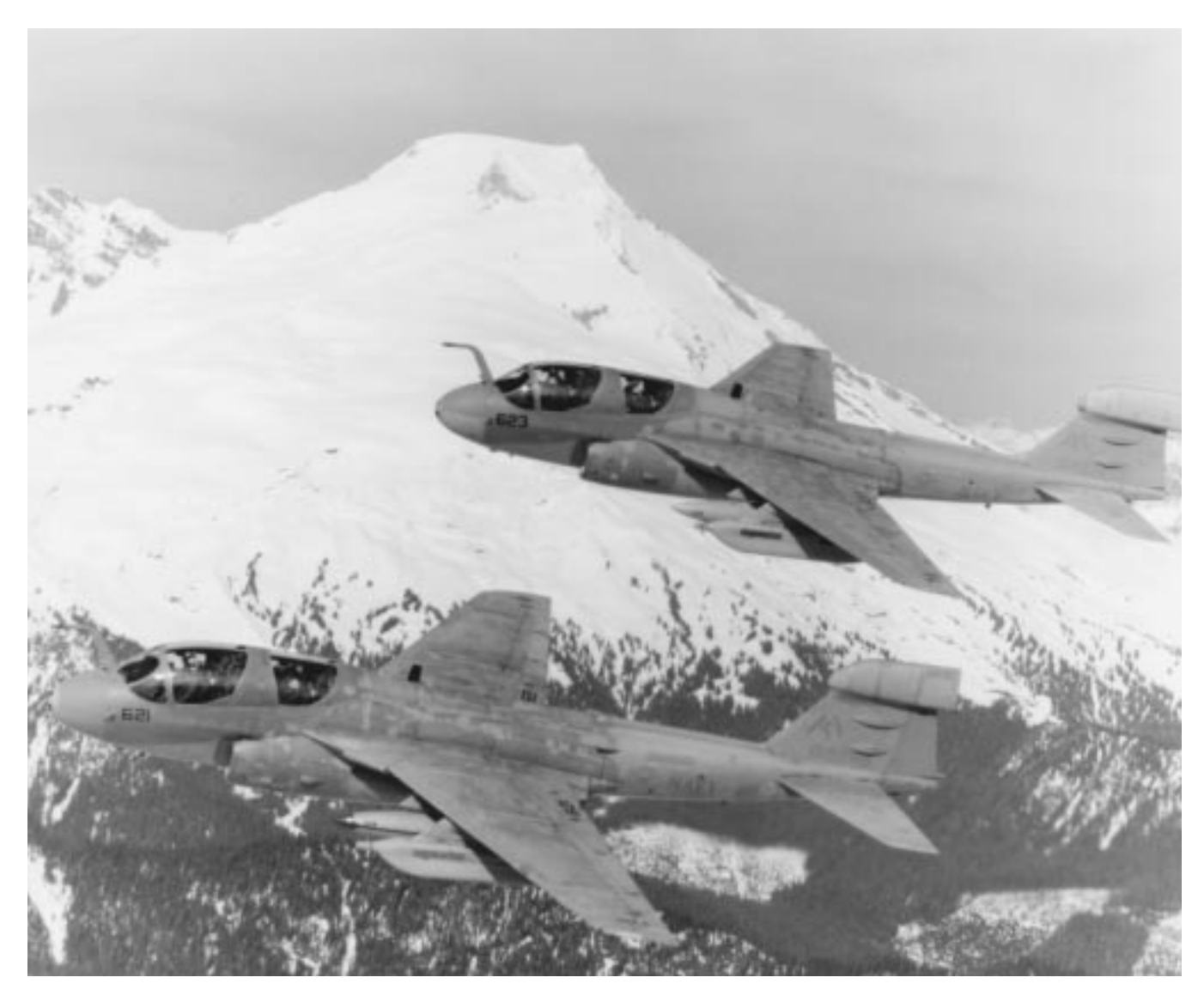
EA-6B Prowlers in flight.