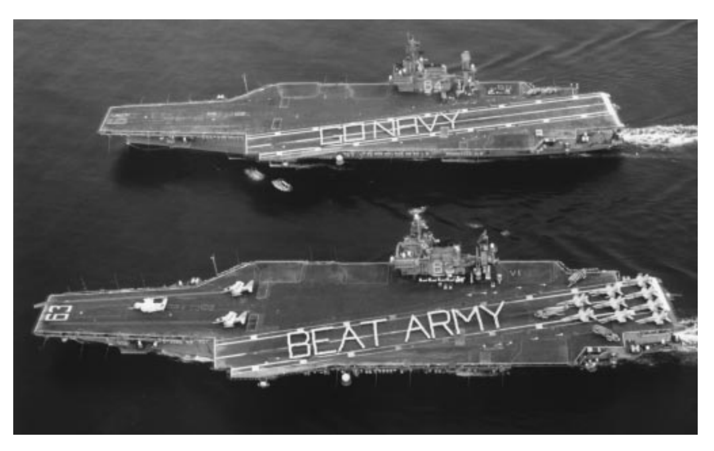
An old maneuver in Naval Aviation, spelling out words on the flight deck.