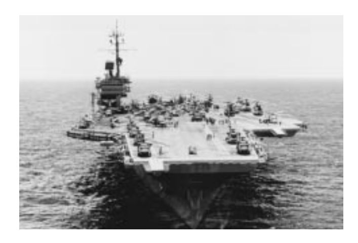
America with a large contingent of army units aboard for deployment to Haiti.

12–13 September A unique operation developed due to the situation in Haiti. Dwight D. Eisenhower and America deployed with a large contingent of Army helicopters on board, but no air wings. The carriers headed for the Caribbean in support of President William Clinton's policy to restore democracy to Haiti. Dwight D. Eisenhower also embarked Navy squadrons HS-7, HCS-4 and HC-2. This was the first time that carriers deployed operationally with a large contingent of Army helicopters and no air wing on board.