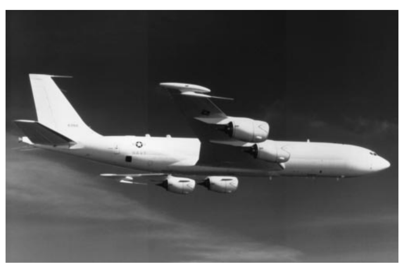
The E-6A Mercury in flight.

7 May The last TACAMO EC-130 began its final deployment from NAS Patuxent River, Md., with VQ-4. VQ-4 was undergoing a transition from the EC-130Q aircraft to the new E-6A Mercury.