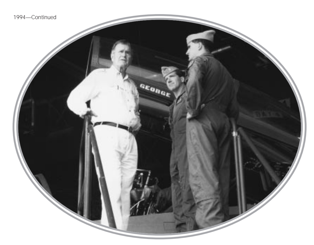
Former president George Bush, also a Naval Aviator during World War II, visited George Washington in August 1995 to mark the 50th anniversary of V-J day.

ment combined forces already in that region assigned to enforce UN Security Council sanctions aimed at restoring democracy to Haiti.