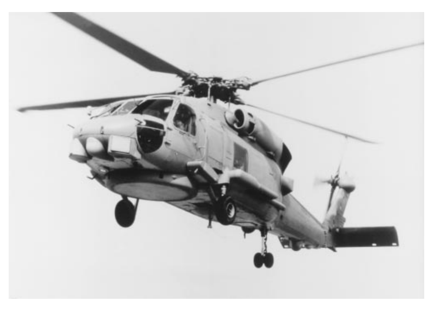
The SH-60B Seahawk.