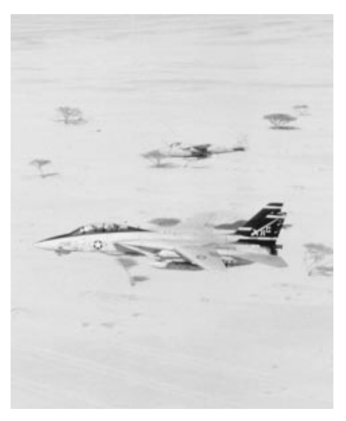
An F-14 and A-6E conduct low level flight operations over Saudi Arabia.