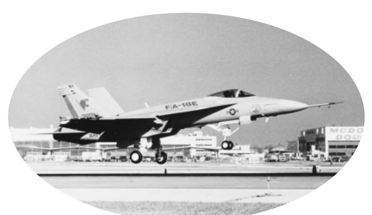
The F/A-18E on its maiden flight.

29 November The F/A-18E Super Hornet made its first flight from St. Louis' Lambert International Airport, Mo.