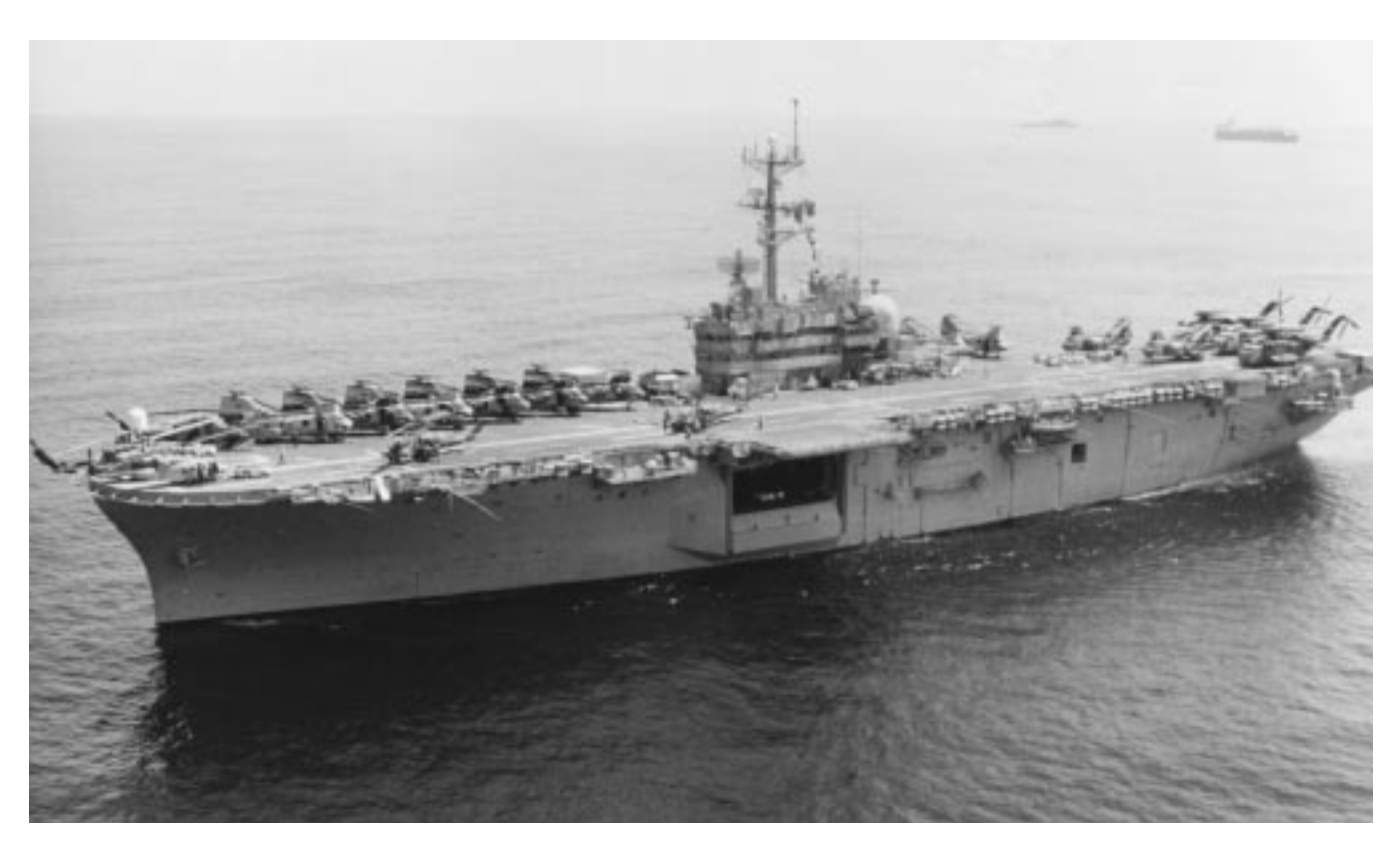
Tripoli off the coast of Mogadishu, Somalia.

8 April Tripoli amphibious task force arrived in Pearl Harbor, Hawaii, after a five-month deployment in support of Operation Restore Hope—the UN effort to relieve mass starvation in Somalia. During the support, task force units recovered 30,000 pieces of ordnance and disposed of more than 100,000 pounds of explosives collected from caches throughout the Somali countryside; launched more than 2000 aircraft sorties from Tripoli and Juneau (LPD 10); delivered more than 175,000 meals and 25,000 gallons of water.