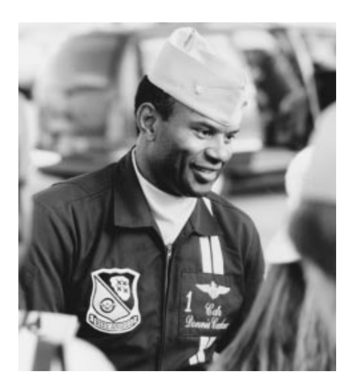
CO of the Blue Angels, Commander Donnie Cochran.

15 November Commander Donnie Cochran assumed command of the Blue Angels, becoming the first African-American skipper of the Navy's flight demonstration squadron. Commander Cochran had commanded VF-11, NAS Miramar, Calif., and had flown with the Blues from 1985 to 1988.