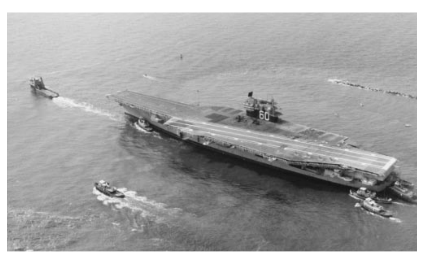
The decommissioned Saratoga under tow en route to Philadelphia, Pa.