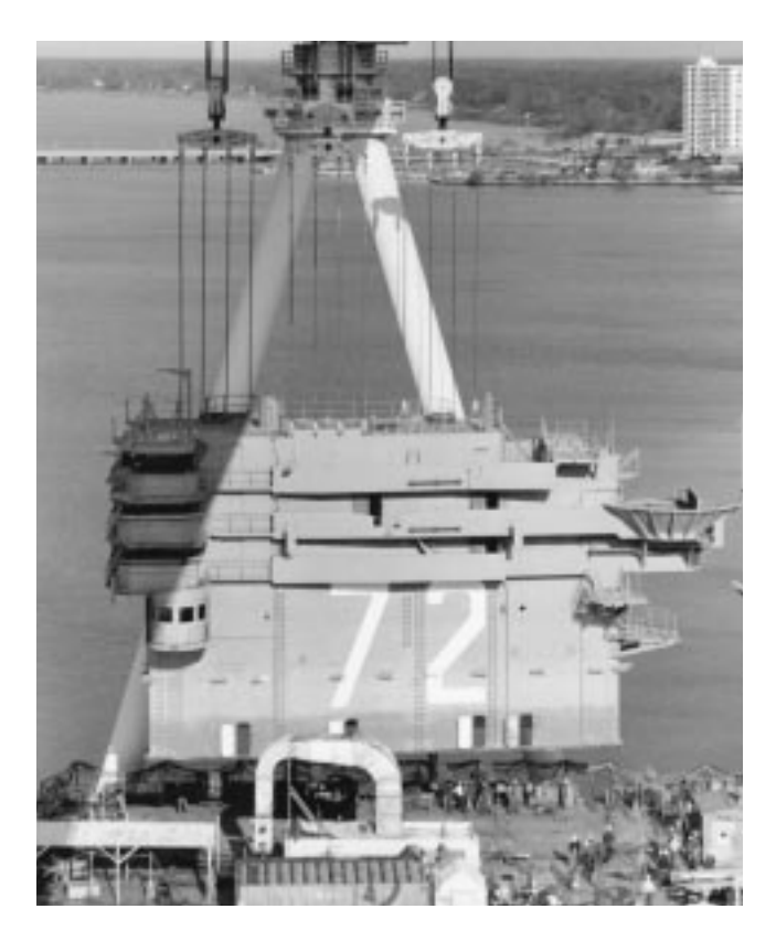
Abraham Lincoln gets her island during construction.

to oversee the military aspects of peace implementation, and Operation Deny Flight ended.