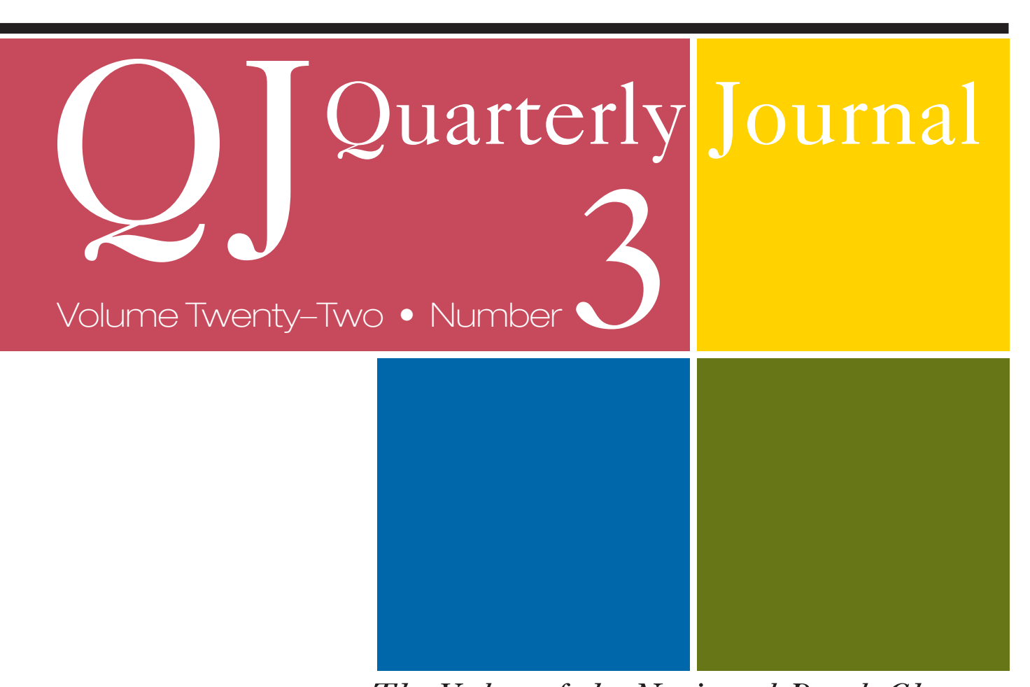
The Value of the National Bank Charter

Comptroller of the Currency Administrator of National Banks