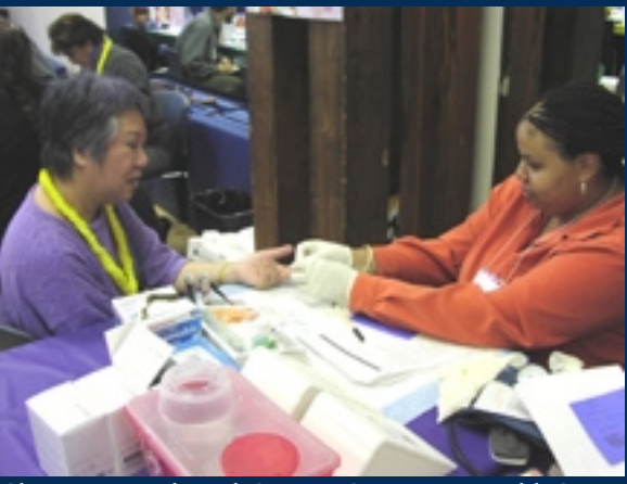
Glucose testing through Sea Mar Community Health Centers.