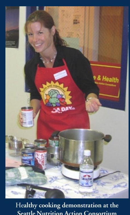
Seattle Nutrition Action Consortium

A second event was held at the South Central Family Health Center in South Central Los Angeles.