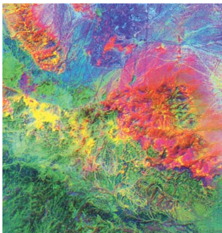
ASTER vnir-swir decorrelation stretch 4(R), 3 (G), 7(B) Saturation stretch.