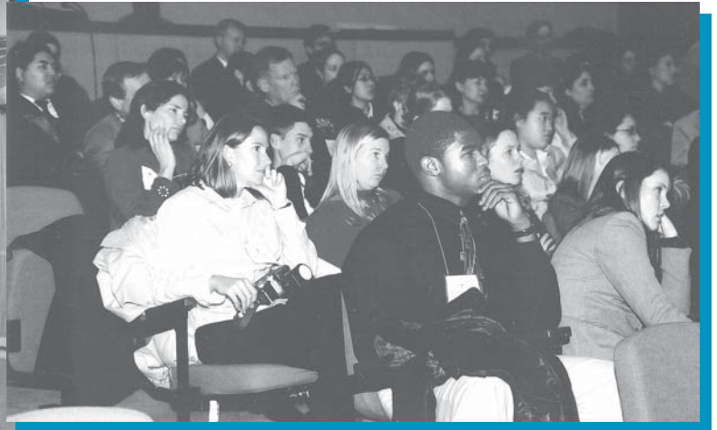
Students listen intently as summit participants make presentations to Ocean Commissioners.

"To succeed in sustaining our oceans we're going to need a full court press from all ocean stakeholders; a concerted and united call from the public and the ocean community for action."