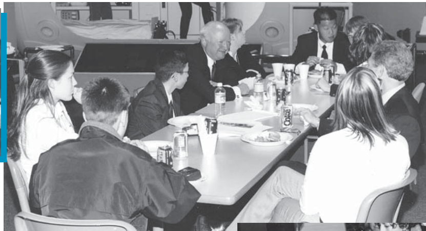
Samuel W. Bodman, Deputy Secretary, Department of Commerce, converses informally with students over lunch at the NOAA Science Center.