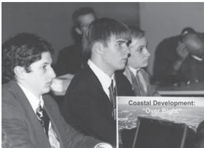
Students from the South Carolina Aquarium present regional concerns on coastal development.