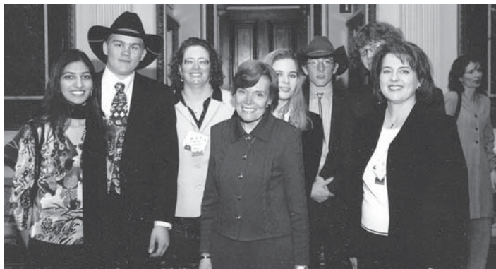
Dr. Sylvia Earle discusses ocean concerns with the Texas student delegation at a White House ceremony.