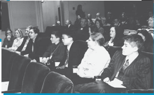
Students emphasized the sustainability of fisheries, marine resources, and coral reef ecosystems as major issues facing our Nation.