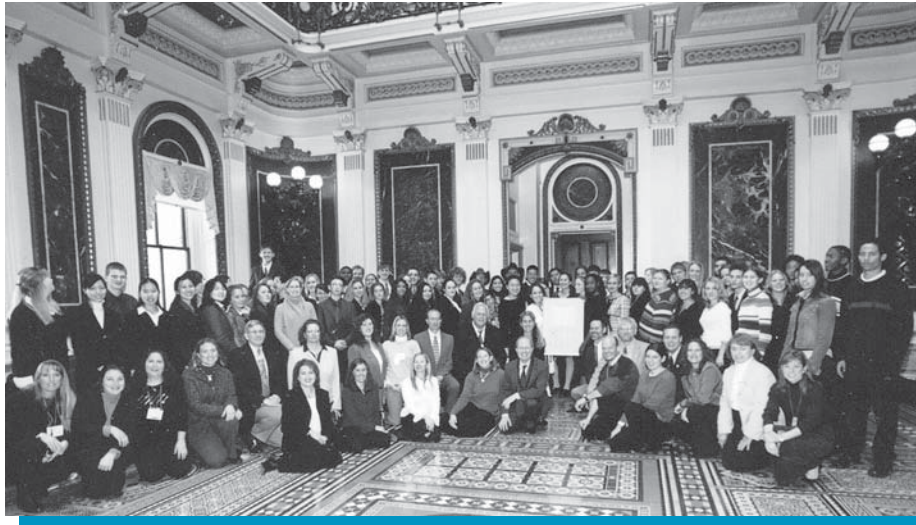
Student Delegation presents Commitments to Action at White House Ceremony and Reception.