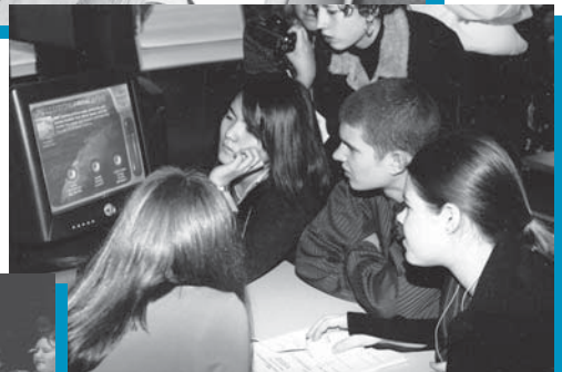
Students huddled around computers to save Stellwagen Bank Sanctuary.