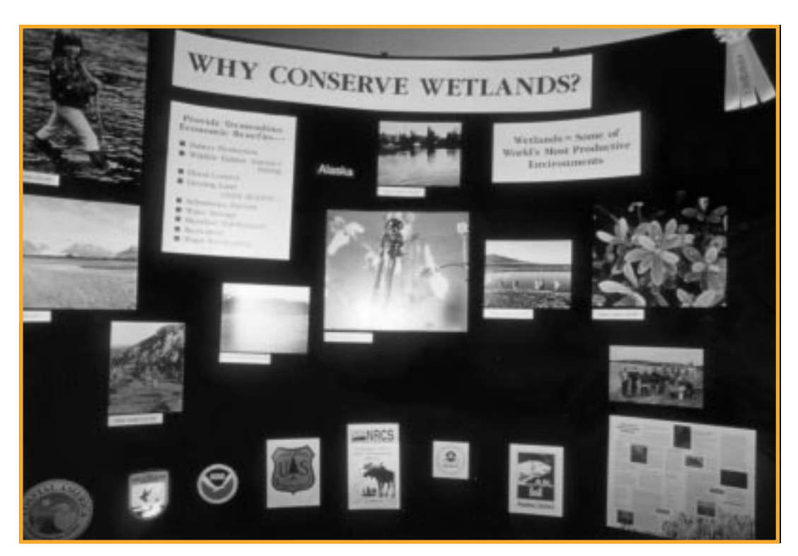
Alaska RIT Wetlands Booth Display.

The AKRIT developed an exhibition booth on wetlands, their function and benefits. The booth was displayed at the Alaska State Fair, August 22 through September 1, 1997, in Palmer, Alaska. During the remainder of 1997, the booth was displayed at the University of Alaska Consortium Library and the Resource Development Council Conference and there are plans for its display at the Anchorage Loussac Library in early 1998.