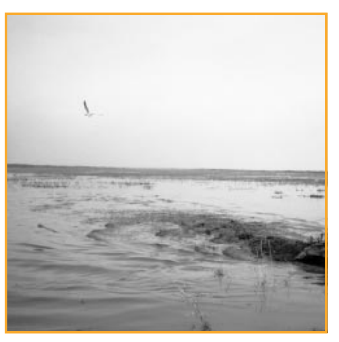
Eroding Shoreline of Lake Borgne, Louisiana.

The Lake Pontchartrain Basin Foundation, located just north of New Orleans, Louisiana, has contacted the GMRIT with a concern about a retreating portion of the Lake Borgne shoreline and associated emergent marsh. As a result of the meeting facilitated by the GMRIT and the Gulf of Mexico Program, the framework of a candidate project was identified and the state of Louisiana indicated its interest in sharing the cost of an environmental restoration project. The U.S. Army Corps of Engineers, as the federal lead, has subsequently requested funds to initiate the first phase of the project process. It is anticipated that other federal and state partnership agencies will collaborate with the Corps in this effort.