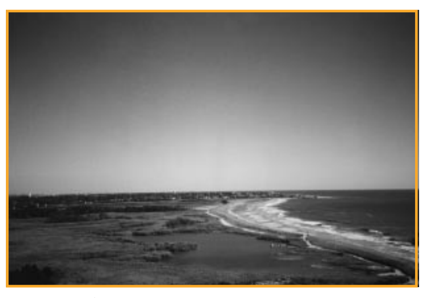
Cape May Meadows Restoration Site, New Jersey.

Cape May Meadows is a 350 acre wetland site near Cape May, New Jersey. The site, which is jointly owned by the state of New Jersey and the Nature Conservancy, is being threatened by beach erosion. The resulting salt water intrusion into freshwater wetlands affects migrating bird habitat. U.S. Army Corps of Engineers is taking the lead in a feasibility study and other partnership agencies are assisting in evaluating alternative plans to address the habitat loss.