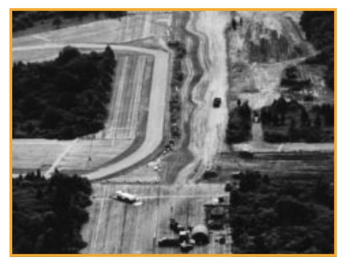
Partial removal of runway by Army reserve unit at Ninigret National Wildlife Refuge, Rhode Island.

The National Implementation Team coordinated the request of the NERIT for military assistance with the Pentagon who, in turn, arranged for an Army Reserve unit to conduct a training exercise on the Refuge. In August 1997 the restoration effort began with the Army Reserves removing more than half of the runways. There are plans to complete the restoration in 1998. The two-week training exercise gave the Army Reserve unit actual experience in removal and heavy equipment operation techniques and resulted in a major ecological improvement for the Refuge.