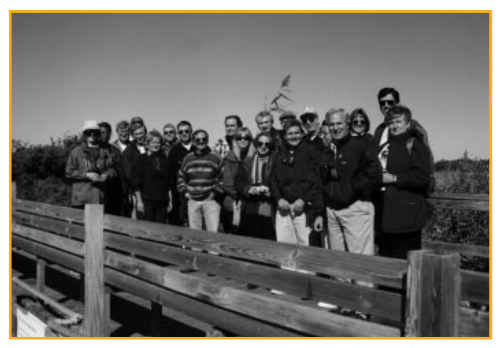
Coastal America Team on field trip to Cape May Meadows, New Jersey.

The Coastal America partnership process minimizes bureaucracy, reduces costs and facilitates planning and implementation of site-specific projects that benefit coastal ecosystems. Increased effectiveness can be achieved by furthering involvement within the federal system and with state and local governments. The Principals Group has urged the representatives of the partnership to encourage program integration and ensure more comprehensive and cost-effective solutions. Toward this end, several Regional Principals Groups have been established to promote greater agency collaboration and enable aggressive regional action. Expanding the involvement of state governments through memoranda of understanding and resolutions with the respective Regional Principals will further the partnership at this level. Also, the Regional Implementation Teams have actively pursued the involvement of local governments and private organizations to make sure that all relevant stakeholders are included in the partnership's collaborative problem solving process. Development of this "shared vision" approach for our coastal ecosystems will improve our ability to restore and preserve the coastal environment.