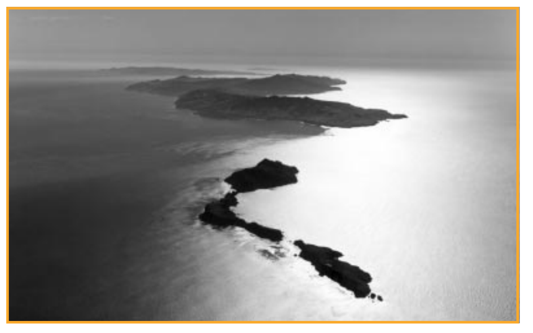
Aerial view of the Channel Islands, California.