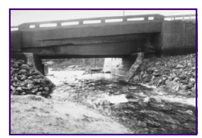
Souadabscook River, Maine, after dam removal.

dam and associated structures. Partners include: Atlantic Salmon Federation; the National Fish and Wildlife Foundation; the Trout and Salmon Conservation Foundation; and the Casco Bay Corporation. Additional funds and technical assistance were provided by NRCS, USFWS and the Penobscot Indian Nation. Additional technical assistance was provided by several state agencies. Volunteer assets were provided by the town of Hampton, Trout Unlimited, the Penobscot Fly Fishers, the Veazie Salmon Club, the Eddington Salmon Club and the Penobscot Salmon Club.