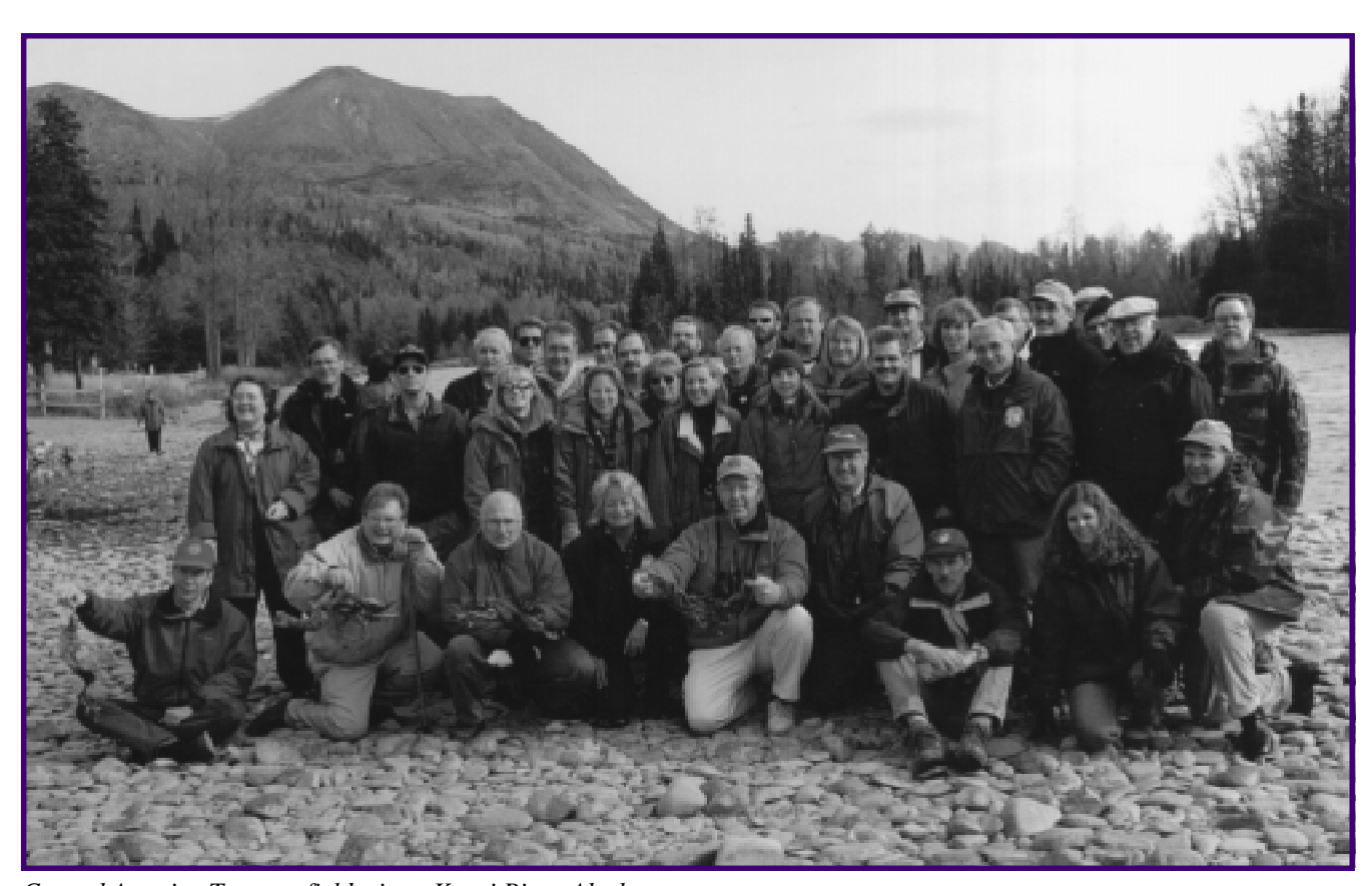
Coastal America Team on field trip to Kenai River, Alaska.

Coastal America is also available to help federal agencies achieve their goals in compliance with the Government Performance and Results Act (GPRA). A summary of GPRA goals for the partner agencies was developed to assist them in determining how the Coastal America collaborative process may be useful in achieving their goals.