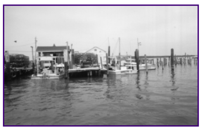
Tangier Island, Maryland.

The Mid-Atlantic Regional Implementation Team (MARIT), approved 11 projects in March 1998 that reflect a consensus of MARIT team members for projects that support the Coastal America goals of restoring and protecting coastal resources. The projects are varied in their scope and reflect the wide variety of coastal issues that the Mid-Atlantic region faces. Projects include: restoration of anadromous fish runs; protection and restoration of submerged aquatic vascular plant communities; restoration of horseshoe crab habitats in Delaware; restoration of tidal marsh habitats in the New York Bight; and the restoration of historic hard clam populations in Long Island Sound. These projects exhibit potential for collaborative efforts to advance project quality and implementation. These designations will allow an opportunity to leverage federal resources and advance authorization and implementation at the federal level.