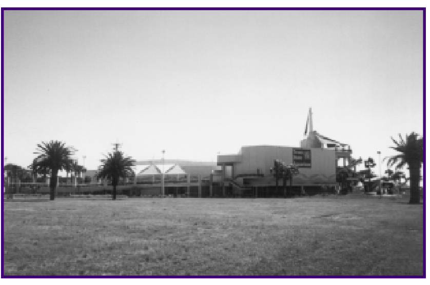
Texas State Aquarium.

Bolstered by support expressed by Coastal America partners and the Gulf of Mexico Program Office, The Florida Aquarium has received funding and started work on a statewide teacher education program for high school marine science teachers. This program, Science Education At Sea, includes 10 one-day workshops being held throughout Florida and a 3-credit summer institute at the University of Tampa.