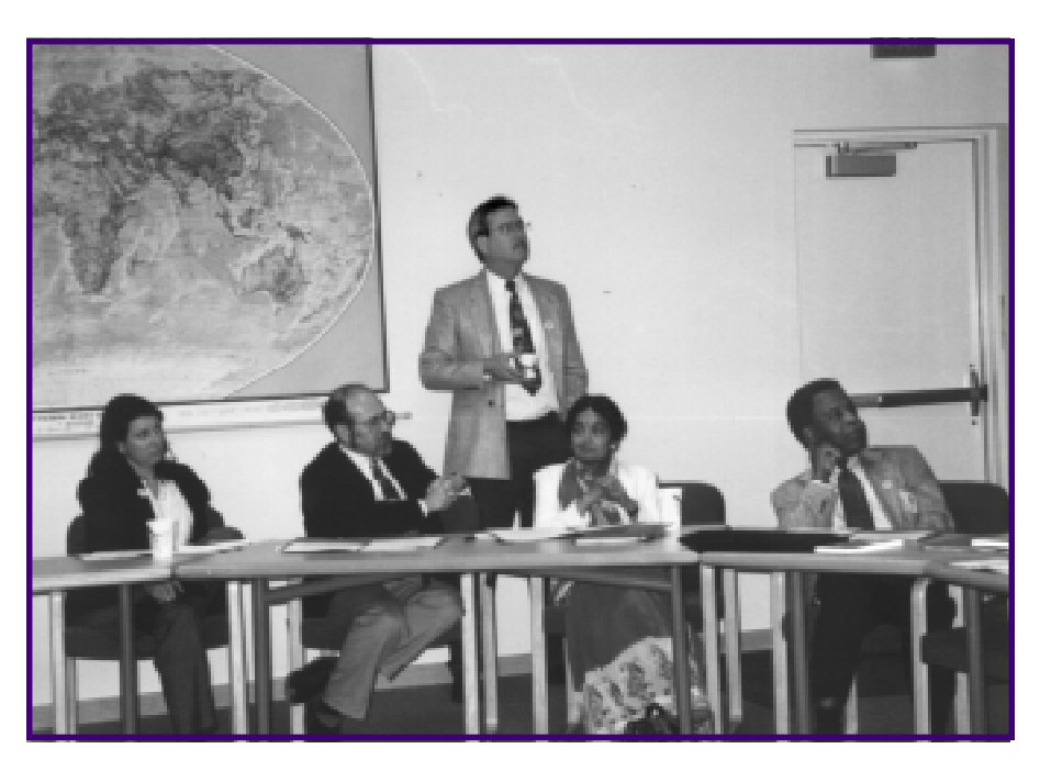
Northwest Regional Principals Meeting.

Northwest Regional Principals Meeting May 1998