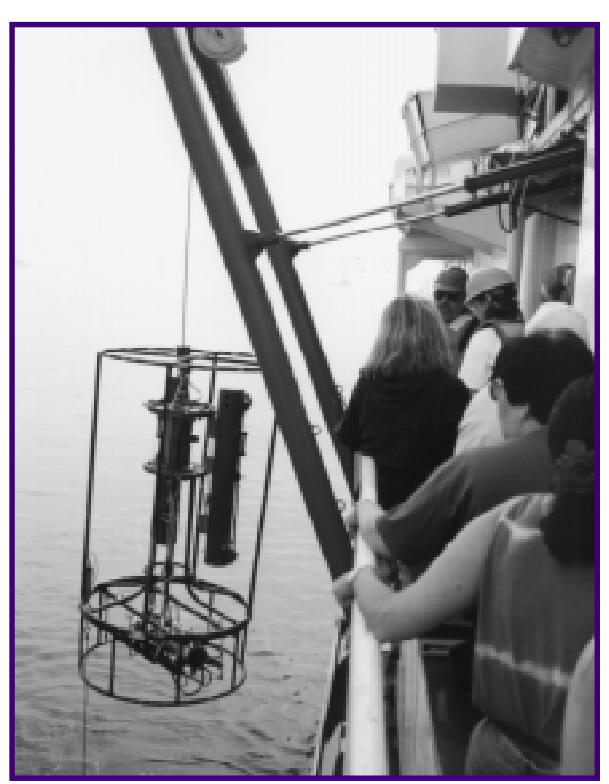
Sampling on EPA's RV Anderson during the New England Aquarium's teacher sabbatical program.

2710 North Shoreline Boulevard Corpus Christi Beach Corpus Christi, TX 78402 (361) 881-1200 www.txstateaq.com