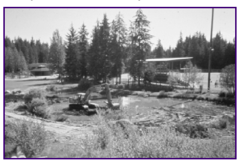
Marsh at Duck Creek, Alaska, during construction.

Duck Creek, in Juneau, Alaska, suffers from decades of development. Its historically abundant salmon runs have been reduced to remnants. Duck Creek is impaired by sedimentation, high iron levels, low oxygen levels and general poor water quality. Restoration efforts to date include construction of ponds and wetlands, and enhancing bridges and culverts to increase stream flows for migrating salmon. There are 26 organizations, small businesses, local, state and federal agencies involved with the monitoring and restoration of Duck Creek.