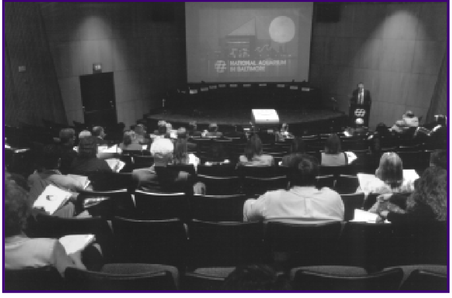
Satellite downlink of National Ocean Conference at the National Aquarium in Baltimore, Maryland.

In addition, East Coast and West Coast Workshops were held with learning center staff and representatives of the federal partner agencies to discuss additional opportunities for collaboration.