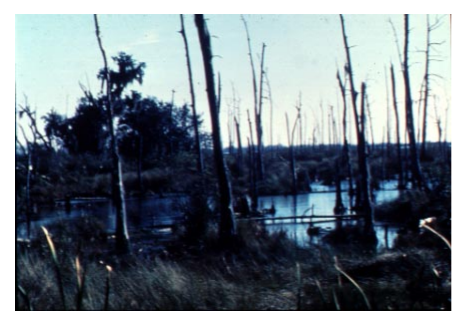
Fig. 1. "Ghost Swamp," Terrebonne Parish, Louisiana.

Flooding from severe hurricanes, submergence associated with local subsidence and sea-level rise, and salinity influences from canals dug in the coastal zones have significantly contributed to the destruction of baldcypress swamps. In addition, many of these areas are now being invaded by exotic and undesirable species of trees that are less able to survive hurricane-force winds and therefore provide less protection to adjacent areas.