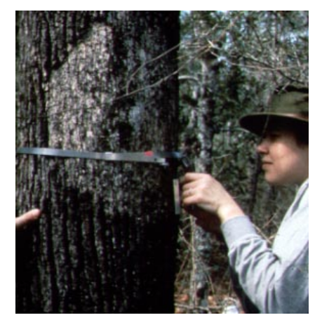
Fig. 1. Rice University researcher measuring tree growth at Big Thicket National Preserve.

In addition to the long-term study, they use tree-ring measurements and weather data to reconstruct past relationships of tree growth to climate and to investigate species behavior near range limits. Annual tree-ring chronologies have been developed from 16 tree species growing on 38 sites distributed across the region. Initial results of tree-ring measurements indicate that individual growth is not substantially slower near the range boundary of a species, which implies that species range boundaries in this region are not set by climatic limitations on individual growth. Thus factors influencing reproduction may be more critical in setting range limits. Also, analysis of the relationship of tree-ring width to climate revealed