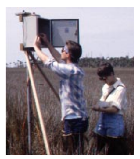
Fig. 1. Researchers monitoring salinity and water depth at St. Marks National Wildlife Refuge for comparison with satellite data.

A progressive classification of a marsh and forest system combining