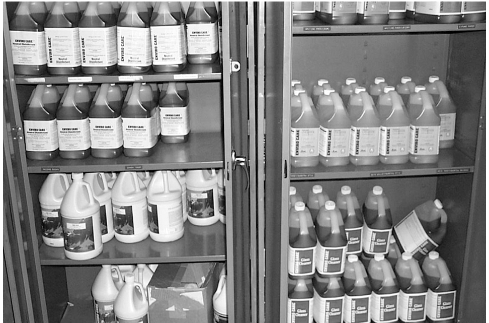
Figure 5: Biobased Cleaning Products Used at USDA's Beltsville Agricultural Research Center