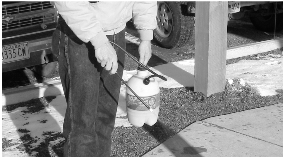
Figure 3: Application of a Biobased Deicer by Interior Employee

biobased products in national parks, the National Park Service Facilities Management Division has covered the incremental costs for park purchases of biobased products over the use of traditional products; in 2003, they provided $42,000 towards this promotion. For example, a wildlife reserve located in Alaska purchased a biobased deicer, made from corn and other agricultural products, to clear roads and sidewalks. Unlike deicers that rely on salt or petrochemicals, biobased deicers can be formulated to have less impact on surface waters and vegetation. Several national parks also are buying biobased fuels and additives for their snowmobiles because they produce less toxic emissions. In addition, biobased hydraulic oils are being used in construction equipment at many park sites because spills of these lubricants pose less environmental risk and are less costly to clean up. Furthermore, the cafeteria-service contractor in Interior's headquarters building in Washington, D.C. uses biobased plates and bowls, made primarily of potato starch and limestone. A pilot project undertaken with USDA's Beltsville Agricultural Research Center demonstrated the ability to compost the plates and bowls along with cafeteria food waste. Figure 3 shows the application of a biobased deicer by an Interior employee. Figure 4 shows other biobased products used by Interior.