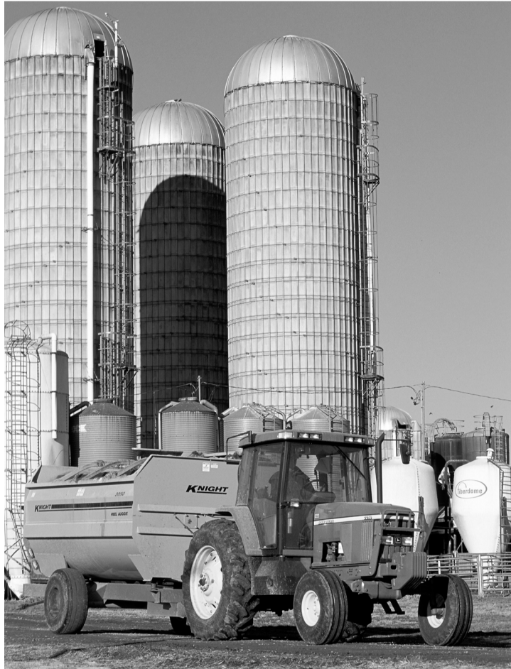
Figure 6: Tractor Run with Biobased Lubricants and Fuels at Beltsville Agricultural Research Center