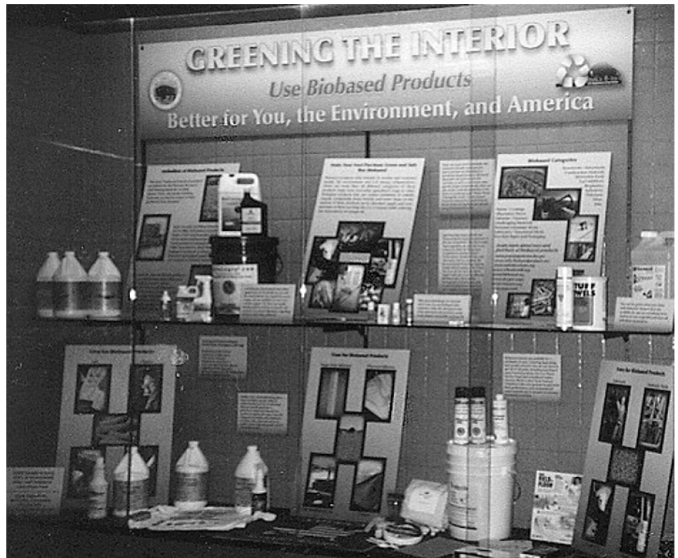
Figure 4: Display of Biobased Products Used by Interior