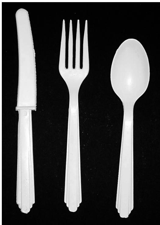
Figure 2: Biobased Cutlery