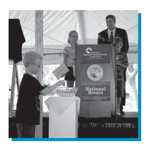
Children poured river water during the Mingling of the Waters.