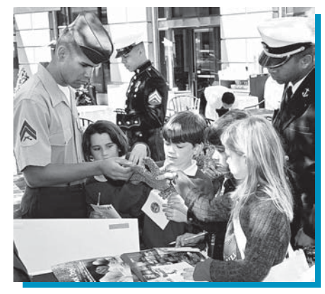
Coastal America partnered with the Navy to teach children about coral reefs, wetlands, and habitat protection.