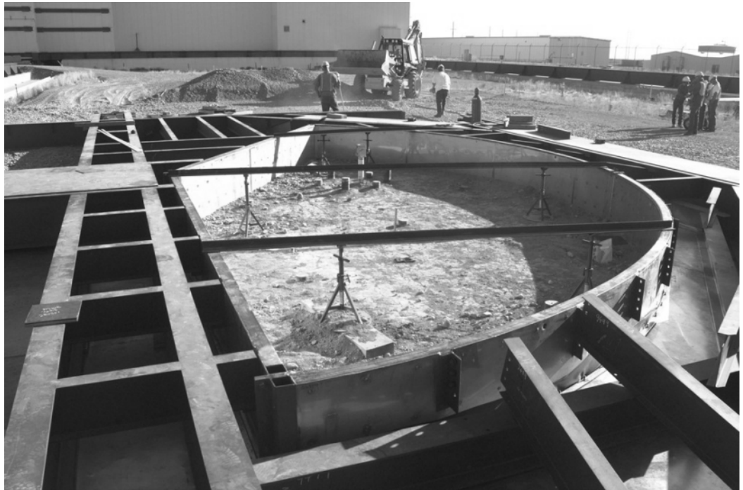
Workers assemble the floor framework that will support the confinement structure

Overburden: the approximately 4 feet of soil that lies over the waste material in Pit 9