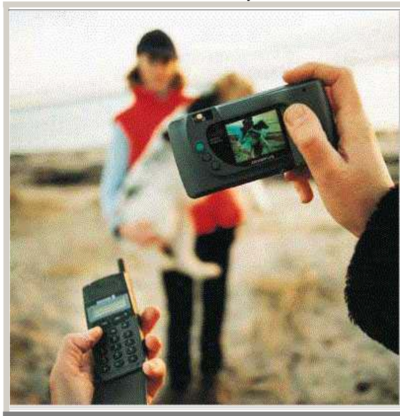
Figure 1. Example Application, Cell Phone to Camera Data Exchange

Bluetooth will be most applicable for exchanging data between personal devices such as cell phones, radios, pagers, personal digital assistants, notebook computers, video and still cameras, audio players, and local area networks (LAN). The mechanism would support automatic synchronization of mobile devices when end users enter their offices. Figure 1 illustrates an example in which a camera transfers a photo object to a cell phone. Some writers also discuss the use of Bluetooth in household appliances, but the applications are unclear. Cell phone to cell phone relay is also considered practical (range permitting) as an alternative to the metered cell relay station.