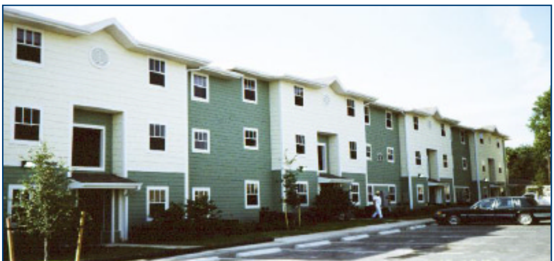
Forty percent of the units in Mobley Place Apartments, Hillsborough FL, will be set-aside as affordable units for households earning 60 percent or below of median family income.

Adding real estate development and other indirect real estate investments, which produce thousands more affordable housing units each year, continued on page 5