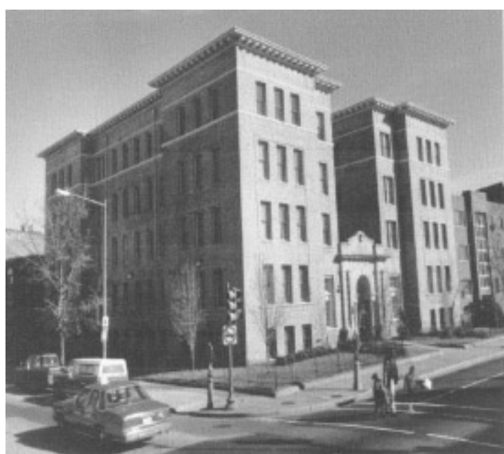
Whitelaw Apartments, Washington, DC. An investment of LISC's National Equity Fund.

bled with the participation of many banks and other corporate investors. LISC also worked with Manna and its other lenders, including (the former) Signet Bank, the Metropolitan Life Foundation, and the Washington, D.C. government, throughout the development process to identify funding gaps, assemble sources of funding, and package the tax credit application.