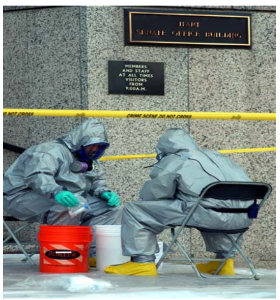
Hart Building Anthrax Response Workers