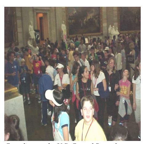
Crowding in the U.S. Capitol Rotunda

Overcrowding of Capitol Building – Employees of the Capitol Guide Service submitted several Requests to us about overcrowding, noise and fire safety in the Capitol Building. Following our investigation, the Capitol Police Board implemented a plan limiting the number of tourists allowed in the building. However, many other fire safety issues in the Capitol Building, such as the audibility of fire alarms, and exit capacity, have not yet been resolved. We are advised that it may be five years