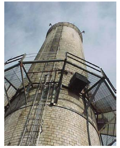
Lightning protection systems at the plant were upgraded in response to an OOC citation.

Our report on the Capitol Power Plant was issued in July 2001. It found major hazards threatening the life and safety of employees and the functioning of Congress. These included dangerous operations being conducted with antiquated equipment lacking adequate safety features; inadequate or non-existent fire protection systems such as alarms, extinguishers and emergency generators; improper electrical equipment and other ignition sources in hazardous areas; deficiencies in inspection and maintenance of boilers; inadequate emergency lighting systems, and improper storage of flammable gas.