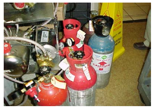
Unsecured Compressed Gas Cylinders

In thirteen (13) locations, including House and Senate Office Buildings, we found chemicals improperly stored, creating the potential for fire and explosion.