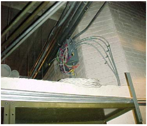
Electrical Junction Box with no Cover and Energized Wires

In thirty-three (33) locations we found electrical junction and switch boxes that were not fully enclosed in order to contain live wires, hot materials or sparks. This is a violation of the National Electrical Code and OSHA regulations, 29 CFR 1910.305(i)(3)(iv).