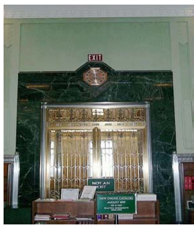
Conflicting Exit Signs for Doorway

In the LOC's Madison Building, a large number of the exit signs located within the Library's offices were improper and misleading. Apparently, this office space had been reconfigured after these exit signs were installed and many did not lead directly to the shortest and most direct route of exit. The exit signs for the public portions of the building generally appeared to be adequate.