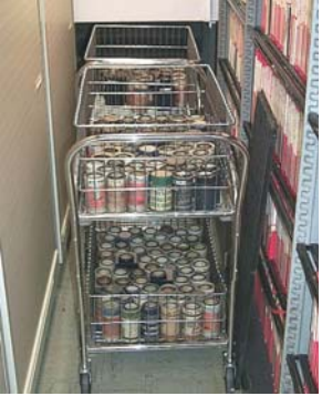
cylinders made of highly

fire prevention plans; appropriate storage of flammable and combustible Old Edison phonographic materials, availability of fire extinguishers; automatic sprinkler systems; flammable cellulose nitrate