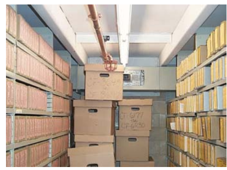
Stored materials prevent proper operation of fire sprinklers

In thirteen (13) locations, we found that fire sprinkler heads were blocked by either stored materials or ceiling tiles. Some heads had been damaged and required repair or replacement. The buildings involved were Dirksen, Cannon, Rayburn, Capitol Police Headquarters and, several other facilities.