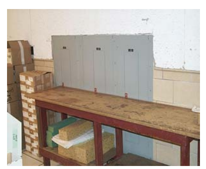
Blocked Electrical Cabinets Prevent Access in Case of an Emergency

The older House Buildings are configured with electrical breaker boxes located in the occupied office space. Access to the boxes was often blocked by desks, computers, bookcases and other heavy objects. In an emergency, quick unobstructed access to these boxes may be essential, in order to minimize the danger of electrocution or fire. Labeling the boxes "Electrical Box–Do Not Block" would help to minimize these blockages.