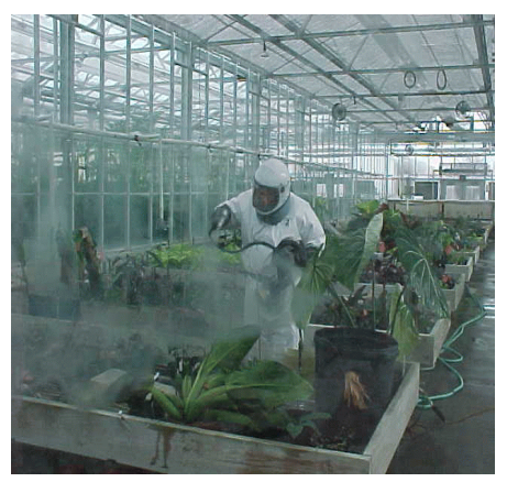
Working in wet locations with pesticides

fungal lung infections or other respiratory diseases which they attributed to their workplace use of herbicides, pesticides and other hazardous chemicals. Following OOC investigations, the Botanic Gardens discontinued the use of many hazardous chemicals and hired a full-time safety specialist. AOC also instituted a comprehensive respirator and approved personal protective equipment program in all facilities.