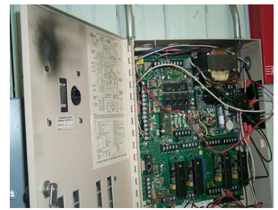
Fire Alarm Electrical Panel Requiring Repairs

Fire alarm systems either were not functioning, or were missing pull stations, or were not monitored and connected to a twenty-four (24) hour monitored station in eight (8) locations. These locations were in warehouses and other non-office facilities. Fires in workshops, garages or other nonoffice spaces can expose all employees in the Legislative Branch office buildings to the danger of serious injury or death.