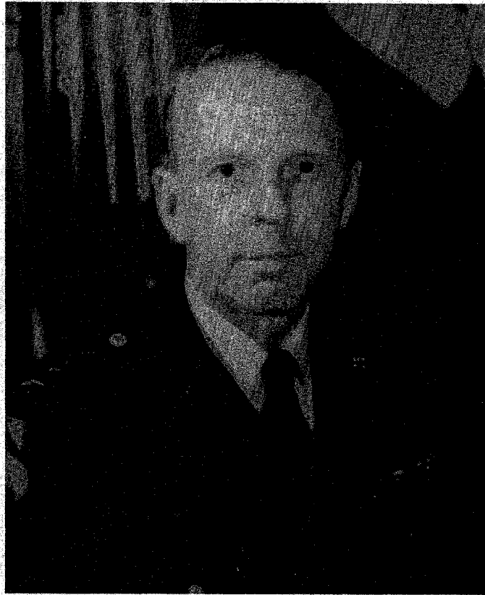
In Tribute to General William E. DePuy