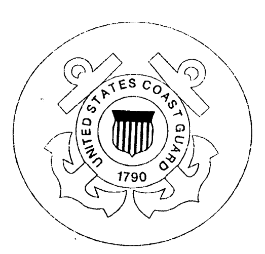
Figure F-1. Illustrations of military emblems