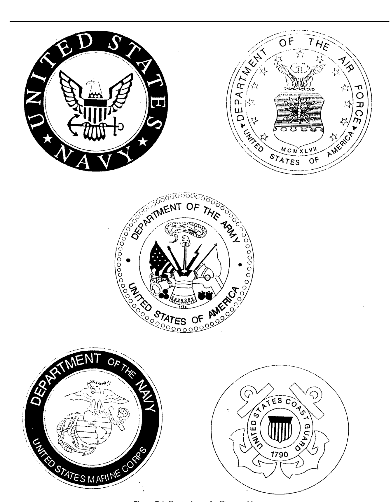
Figure E-1. Illustrations of military emblems