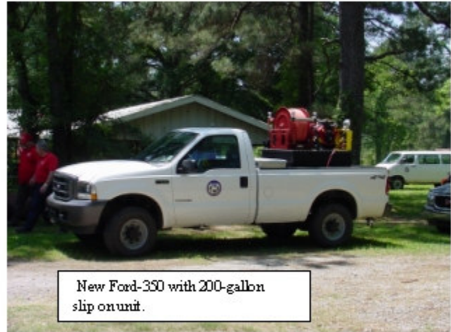
New Ford-350 with 200-gallon slip on unit.

This NFP grant affects thousands of homes across the state by adding another dimension to Louisiana's firefighting resources and vastly improving pre-suppression fuels treatment and suppression capabilities.