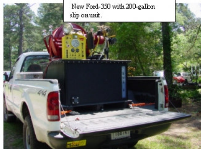
New Ford-350 with 200-gallon slip on unit.