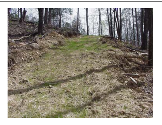
This fireline was mulched and seeded to minimize soil movement. Six weeks and six inches of rain (in a 24 hour period) later there was little soil movement.

For additional information on the National Fire Plan, visit www.fireplan.gov