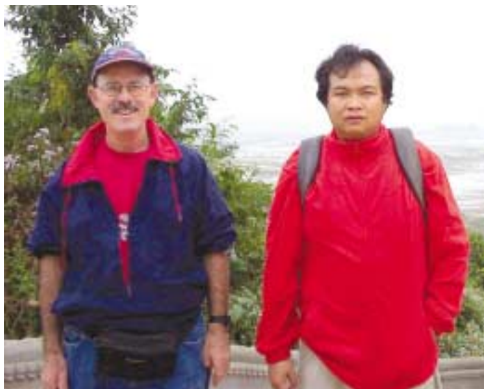
The author and guide on a ridge in northern Laos.

Our last stop on the second day was a stupa, a Buddhist religious monument called That Poum Pouk. This stupa was constructed as part of a competition between the Lanna Kingdom, based in what is now northern Thailand, and the Lane Xang Kingdom, based in what is now Luang Prabang, the ancient capital of Laos. It was an effort to prove which kingdom was more