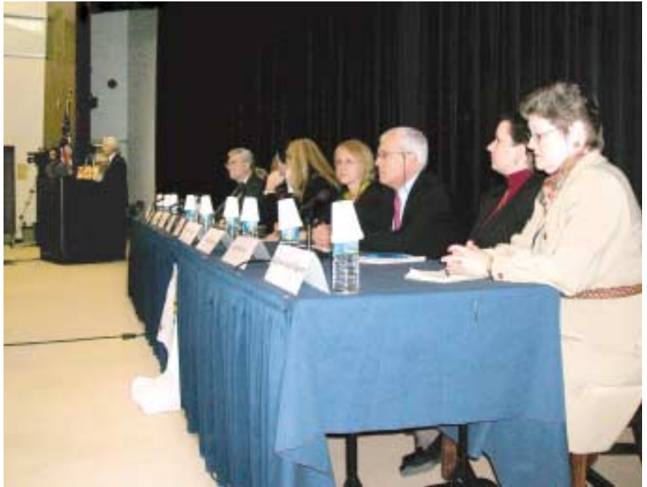
Panelists answer questions about serving in Iraq and Afghanistan.