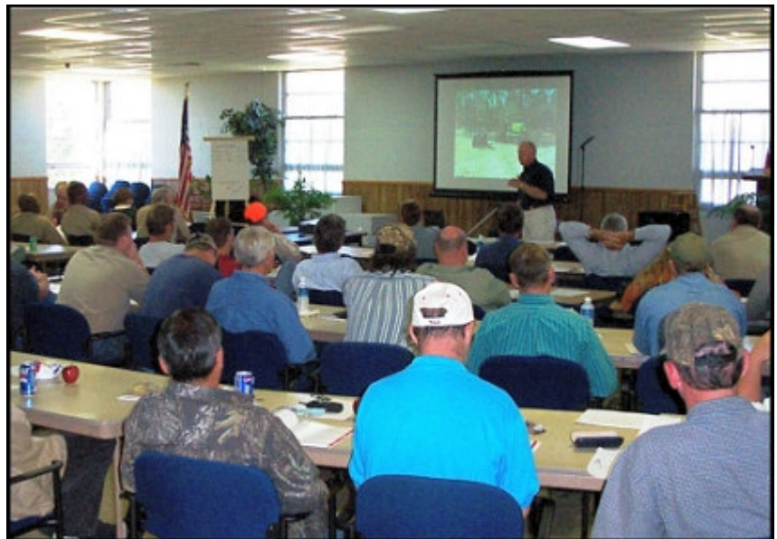
Prescribed burn managers get smoke mitigation training in Thomasville.