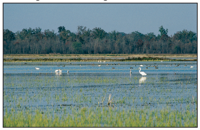
Over 170,000 acres of wetlands have been enhanced or protected in watershed projects and an additional 162,000 acres of wetlands have been created.