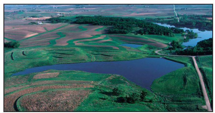
Lakes formed by the watershed dams have created thousands of acres of open water providing excellent fish and wildlife habitat and areas for migrating waterfowl to rest and feed.

Whatever the primarily purpose, watershed projects have many community benefits such as fish and wildlife habitat enhancement, that sometimes goes unnoticed.