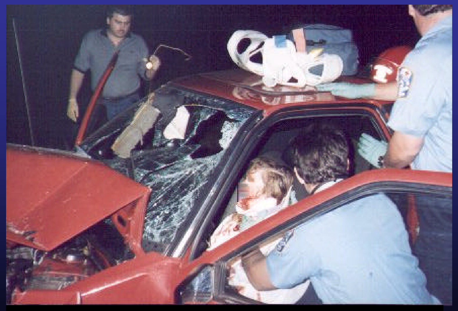
Say "No" to alcohol when you know you will need to drive