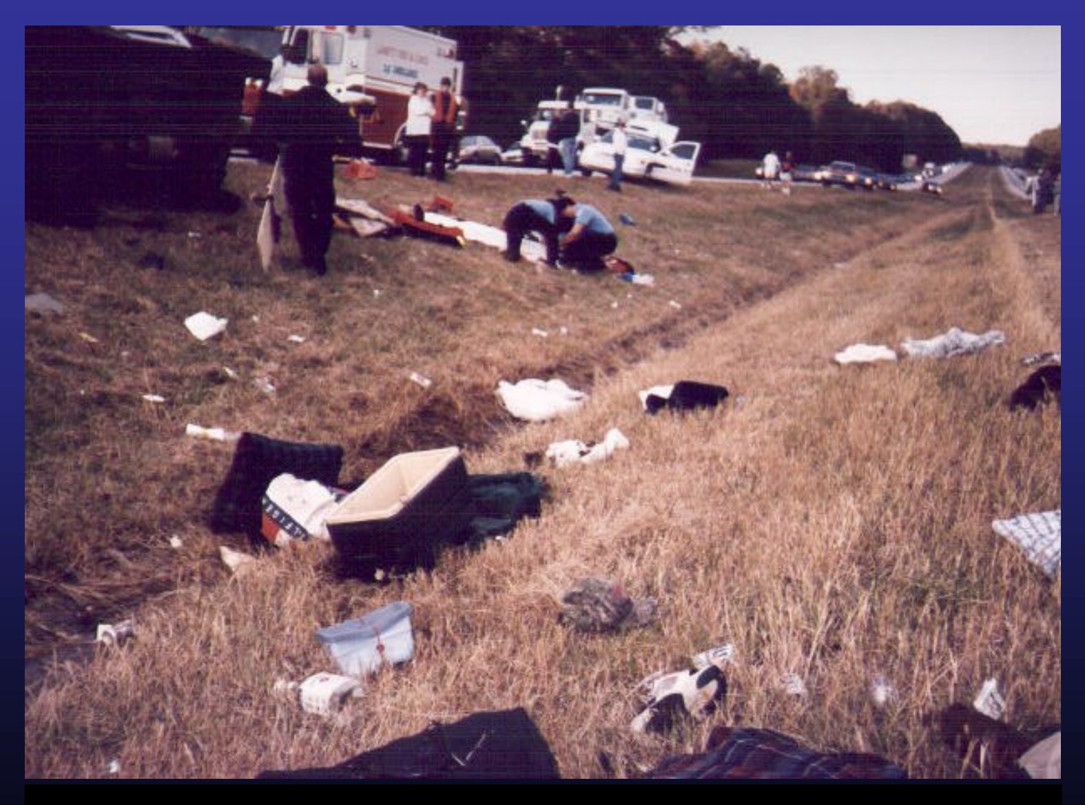
Alcohol related crashes are the # 1 cause of deaths among Americans between 18 & 30