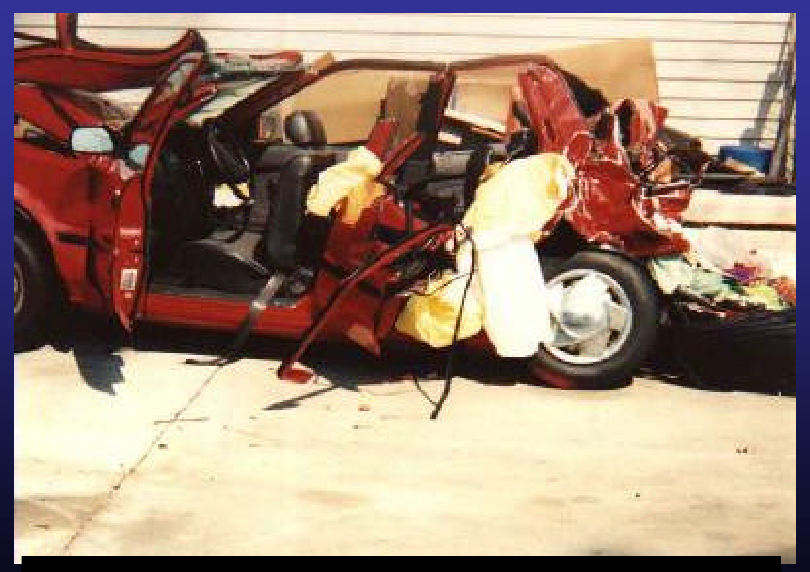
Don't give in to peer pressure