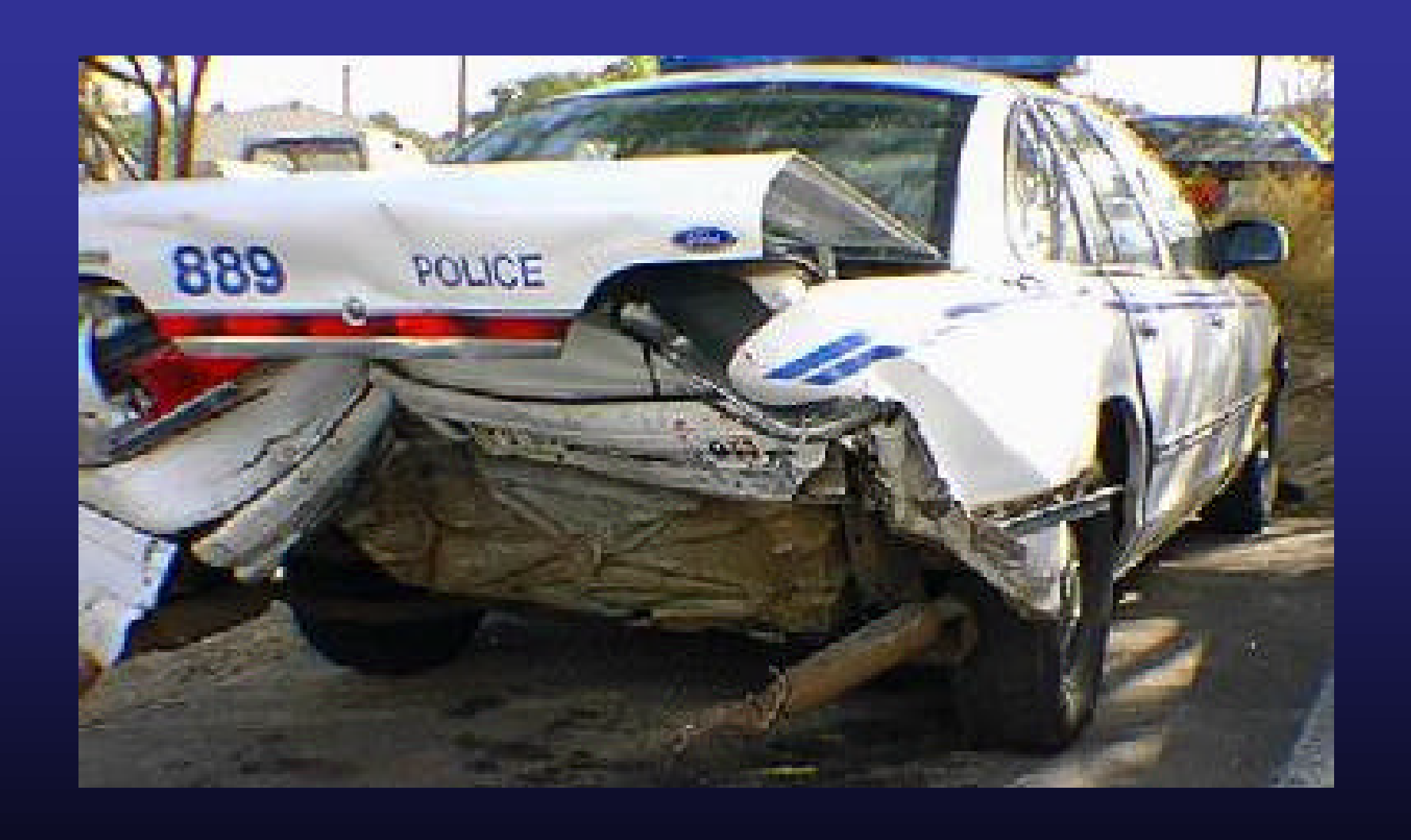
Take a taxi instead