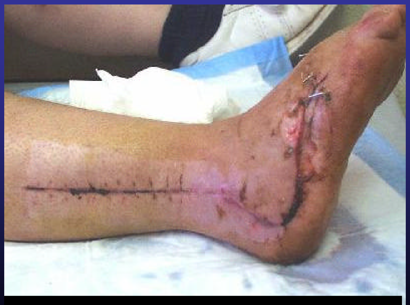
Stay alert when driving at dangerous times