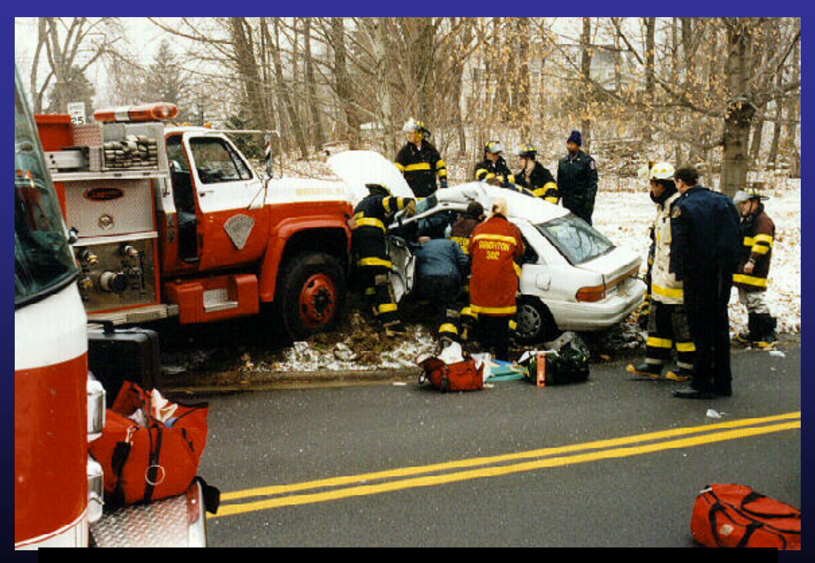
Notify police of any suspicious drivers