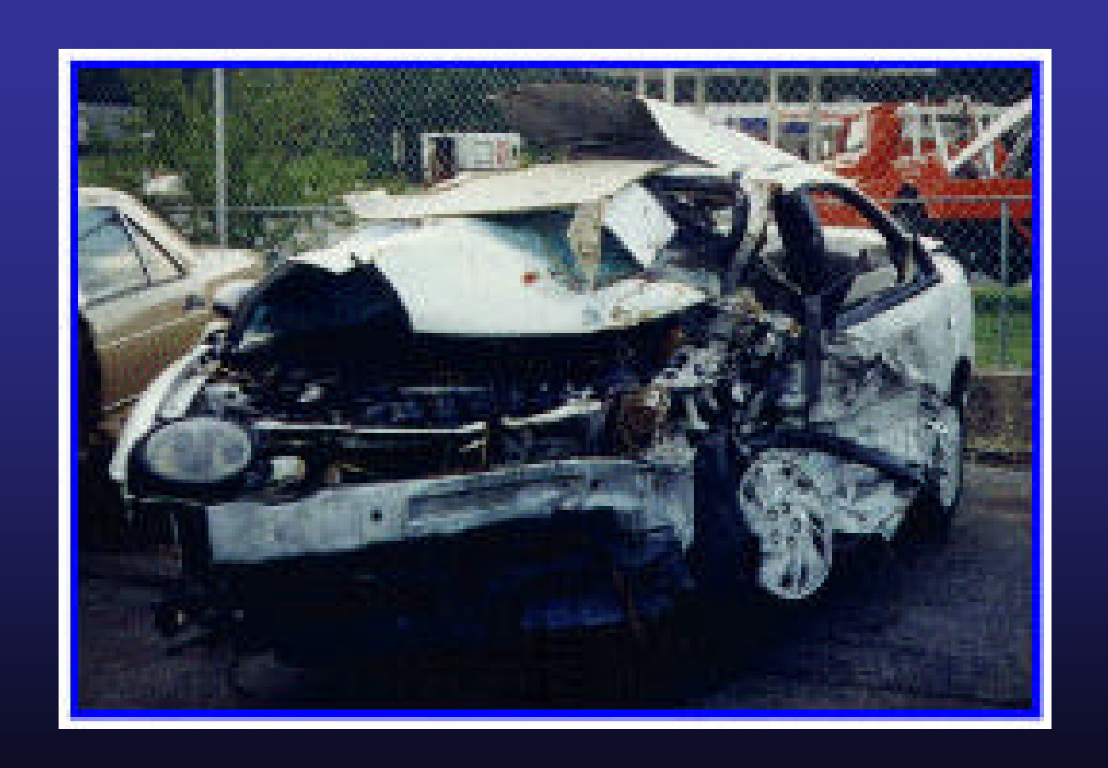
Only TIME will sober you up