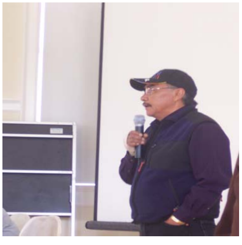
Institutional Development Presentation

1. Housing policy, planning, and operation often ignore key stakeholders. For a variety of reasons, many tribal programs operate with little collaboration and cooperation amongst or with each other. In part, this reflects the funding calendars or partial funding allocations by different federal departments and agencies that, in turn, may experience little collaboration and coordination.