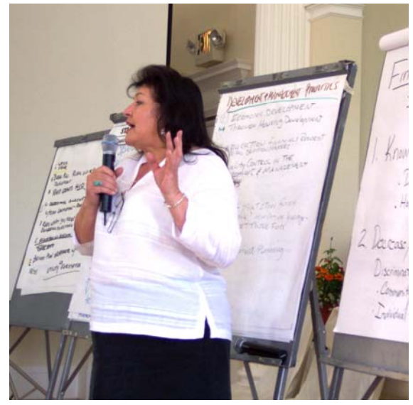
Finance and Funding Team Presentation

3. Tribes have needs for more information, knowledge, and experience with financial planning and operations. Some tribal members and officials need training and education in financial planning and related areas to become informed homebuyers and to be able to access and use existing capital markets efficiently.