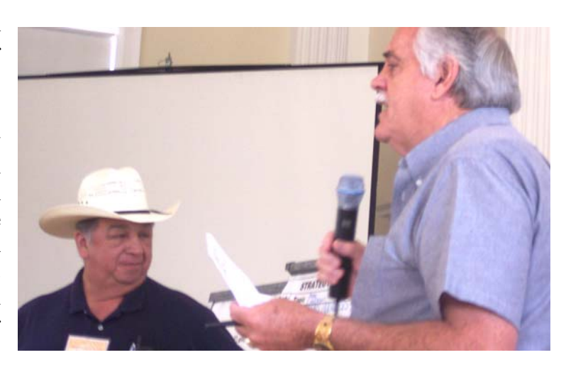
Housing Development and Management Team Presentation

1. Housing stock must be greatly expanded to meet current and projected needs, and job creation must be accelerated to decrease high levels of unemployment on reservations and tribal lands. Many tribal members reside in substandard, over-crowded, and/or unsafe housing.