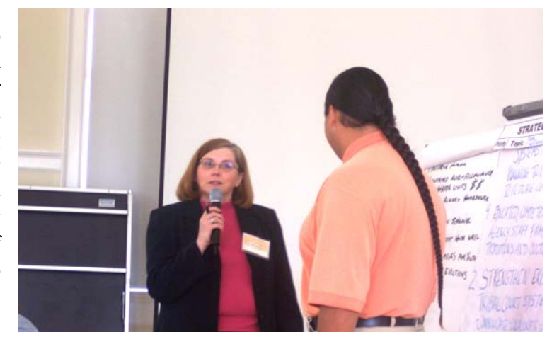
Strategic Planning Team Presentation

construction and rehabilitation. Most tribes need the resources to develop water, sewer, utilities, and other infrastructure required for housing projects. Inadequate infrastructure restricts housing construction projects on many reservations. In order to build the needed housing, tribes should specify the infrastructure needed, the cost of materials, supplies, and labor to develop the infrastructure, and request appropriate funding from Congress.