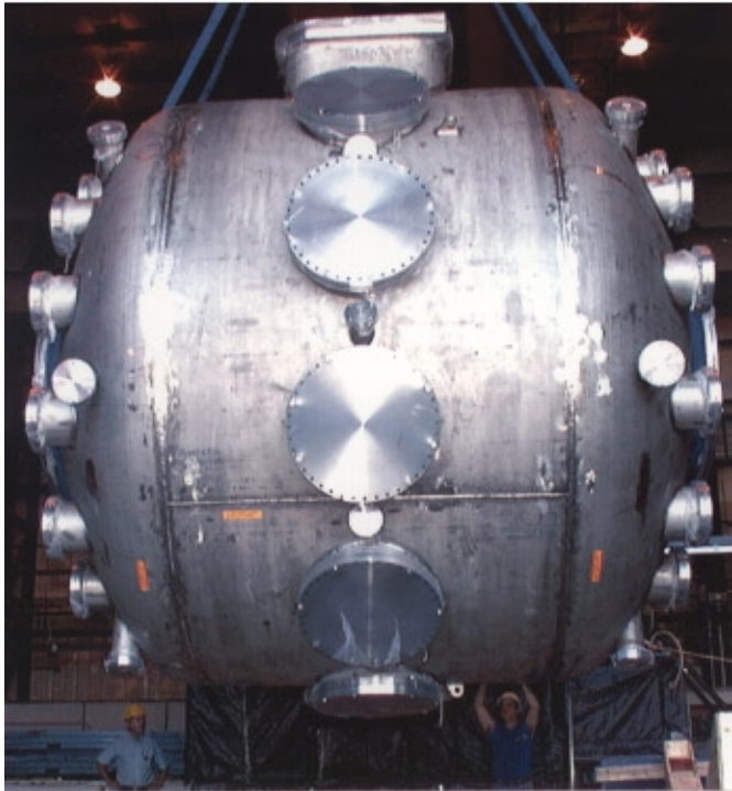
Construction of the National Spherical Torus Experiment (NSTX) progressed rapidly. The 23,000-pound vacuum vessel for NSTX arrived at the Laboratory on August 5, marking a major step in the construction of the new device. Earlier in the summer, the world's tallest ohmic-heating solenoid was delivered to PPPL and lowered over the inner toroidal-field coils of NSTX, which were also major milestones in the assembly of the project.