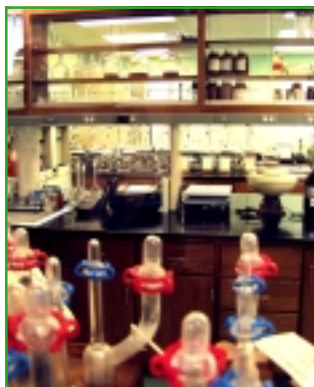
One of the new PEARL labs.

The new facilities include wet, hot, and counting labs, each of which are about 25 feet by 25 feet in size and include oak desks. At the wet lab, staff prepare samples of water from the D-Site LECTs, rainwater, surface water, ground water, soil, and biota, as well as prepare the environmental