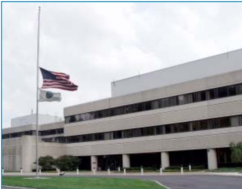
The flag at PPPL was flown at half-mast in memory of the victims of the September 11 attack on the nation.