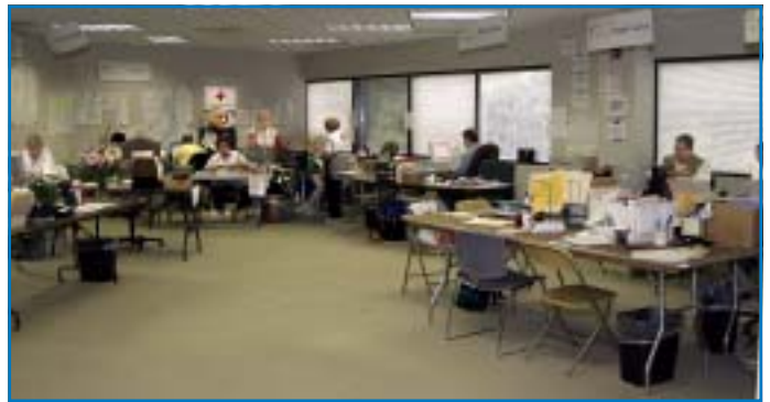
PPPL loaned tables and chairs to the American Red Cross, which set up offices (above) at Carnegie Center to respond to the September 11 tragedy.