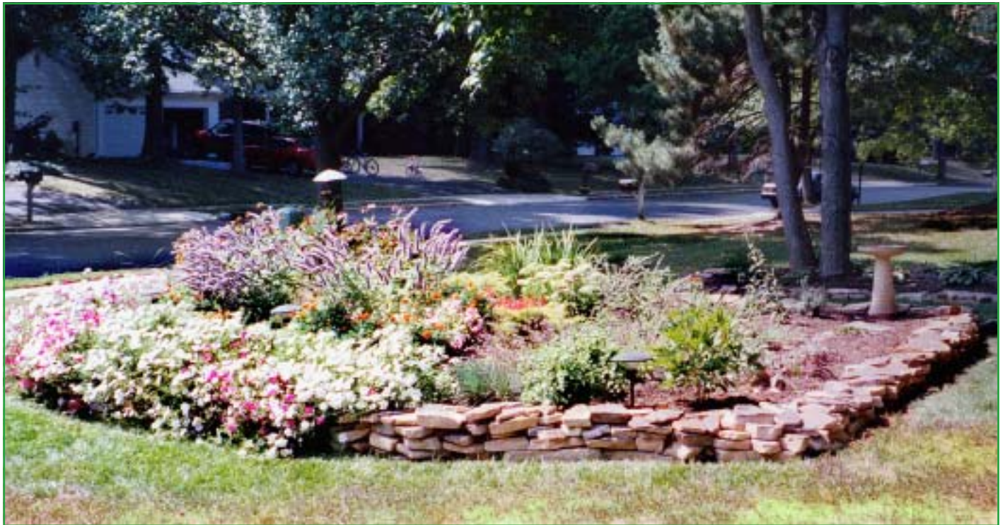
The McGeachen xeric garden.