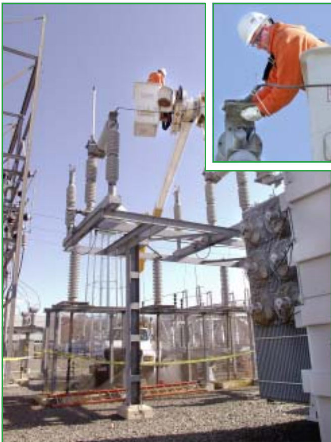
Bill Burchill disconnects an old switch in the switch yard.