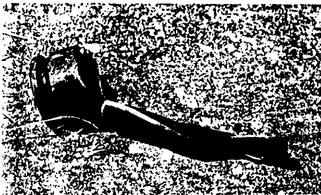
Fig. 8. Shell base located at 465 ft.

Sample analysis was accomplished by acid leaching all deposited material from the glass fiber filters (including material filtered from wash water) and analyzing for uranium. Samples electroplated onto counting planchets were analyzed radiometrically above a detection limit of about 7 \mu\text{g} . If the sample activity was below this detection limit, a fluorophotometric method with much greater sensitivity (about 0.1 \mu\text{g} ) was used. 6 This method, based on intense yellow-green fluorescence at 555 nm of the uranium-sodium fluoride system, was subject to interference by iron from the probes, necessitating extraction of uranium by a liquid ion