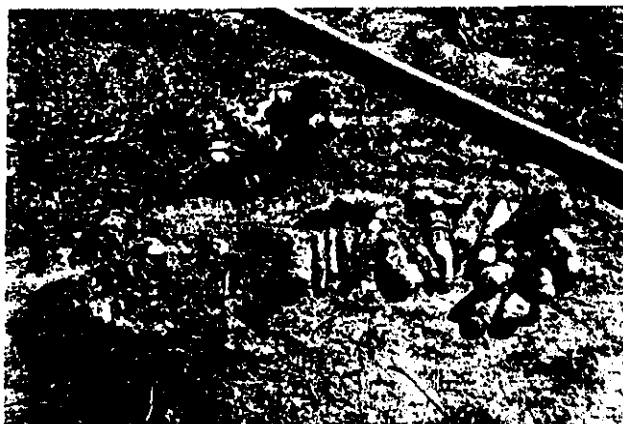
Fig. 5. Penetrators and fused masses recovered from the bonfire.

A small fragment (about 3 x 5 cm) was located the day following the test ~700 ft from the bonfire. This is 350 ft beyond any other fragment location in this test and 240 ft beyond any fragment location in three earlier tests performed at Eglin AFB on similar ammunition containing the same cartridge case and equivalent propellant load. 5 The low mass of the fragment and its extreme distance from the bonfire suggest that this is an artifact due to some mechanism of transport other than ballistic projection. Wildlife in the area, ravens in particular, are frequently attracted to shiny metal objects such as this fragment, and are known to move objects even larger than this fragment. We consider this the probable explanation and have omitted this fragment from pattern scoring of the test. Complete scoring data sheets have been forwarded to AFATL, Eglin AFB.