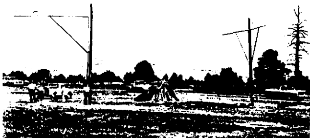
Fig. 3. Overall arrangement of stack and samplers.

Wind velocity and direction were highly variable in advance of the test, ranging from 1 to 3.5 m/s and coming from the northeast quadrant. Wind velocity was considered acceptable, but its direction was not ideal because (a) the pole holding primary samplers (1 and 2) had been located in anticipation of the prevailing southwest wind, and (b) nearby office buildings and the observation point for the test were almost directly downwind of the bonfire. However, free-lift balloons released just before the scheduled test time remained generally south of these sites and exhibited consistently rapid rise. Since Samplers 3, 4, and 5 could be relocated for these existing conditions, and the weather forecast indicated similar