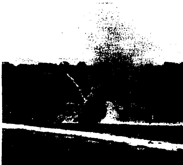
Fig. 4. Telephoto of the bonfire midway through burn.

The temperature recorder (and samplers) was started 4 min after squib firing. Temperature history is summarized in Table III. All four thermocouples responded but only No. 1 and No. 3 reached the expected temperature. Table III indicates peak temperatures and the temperature 10 min after squib firing, to correspond (within ±1 min) with the first shell disruption. Thermocouple 1 was located