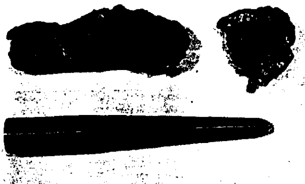
Fig. 1. Test penetrator fragments after mechanical cleaning. Spare penetrator included for comparison.

The largest cleared and reasonably level area available for this test was R-Site, firing points E-F. Its long history of tests involving explosives and uranium has left it relatively clear of large trees and completely unrestricted where a new source of uranium contamination was concerned. Its distance