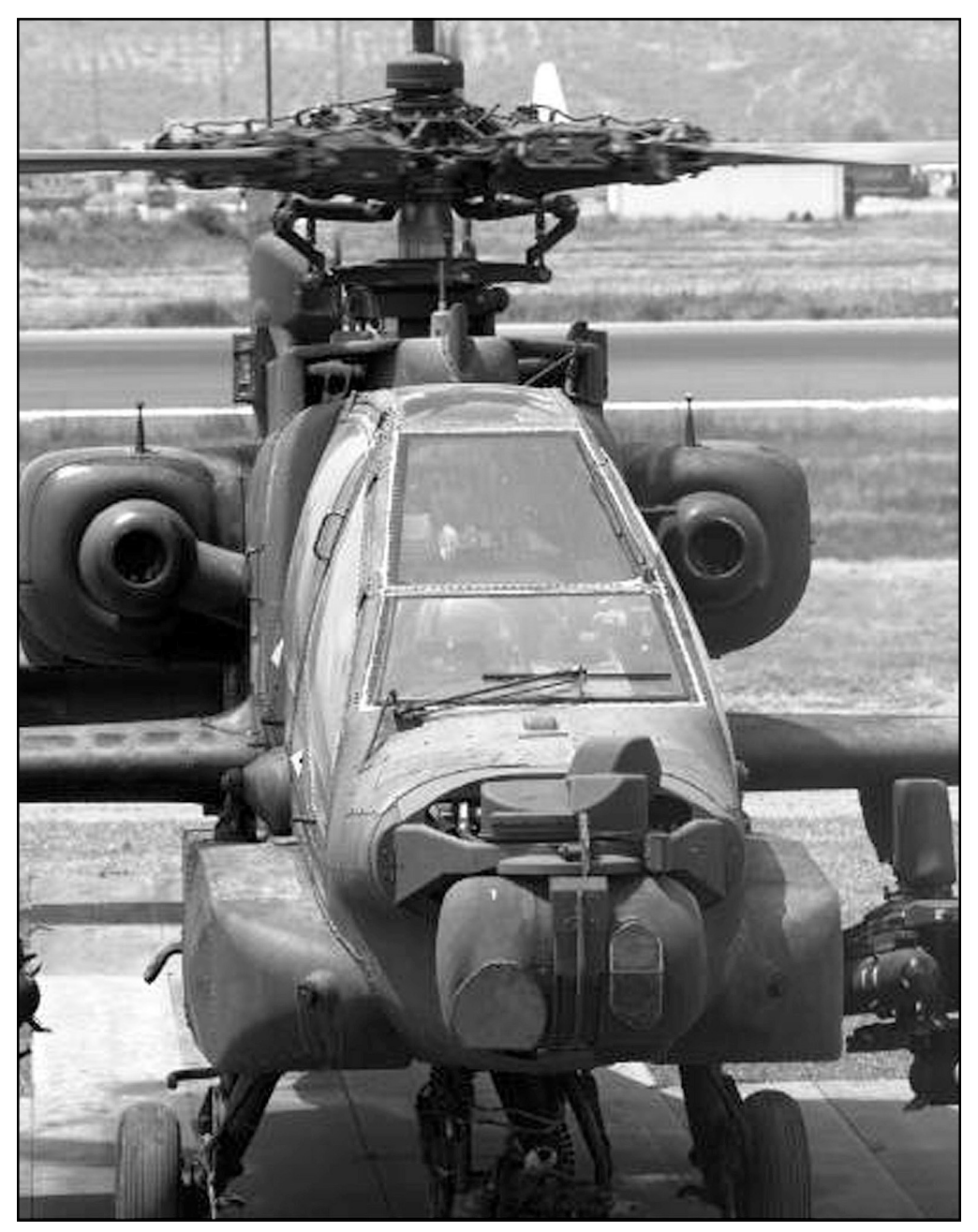
The AH-64 Apache Attack Helicopter sits ready to perform a QRF (Quick Reaction Force)

to be an SBA pilot program. Because of the tremendous cost of building a completely new aircraft, this program used