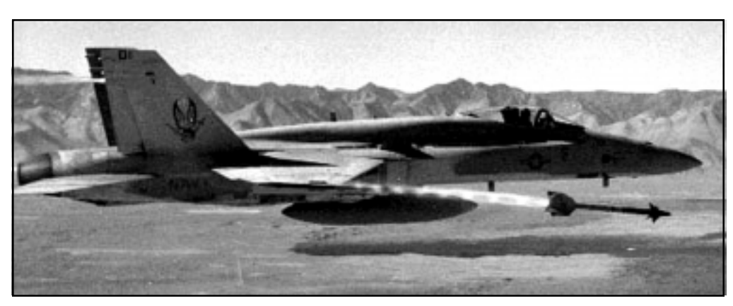
The Soviets were able to acquire the AIM-9 air-to-air missile technology and quickly reverse-engineer it into an AIM-9 clone.

Another threat that increases the opportunities for exploitation is the increased exposure of U.S. weapons and the technologies they contain during contingency operations. As has been widely reported, U.S. forces are now deploying abroad at a much higher rate than at any time during the Cold War. Invariably, as was demonstrated by the shootdown of Capt Scott O'Grady, military systems will be lost in battle or by accident. There is no guarantee that such losses will be mitigated by damage to the equipment and in most