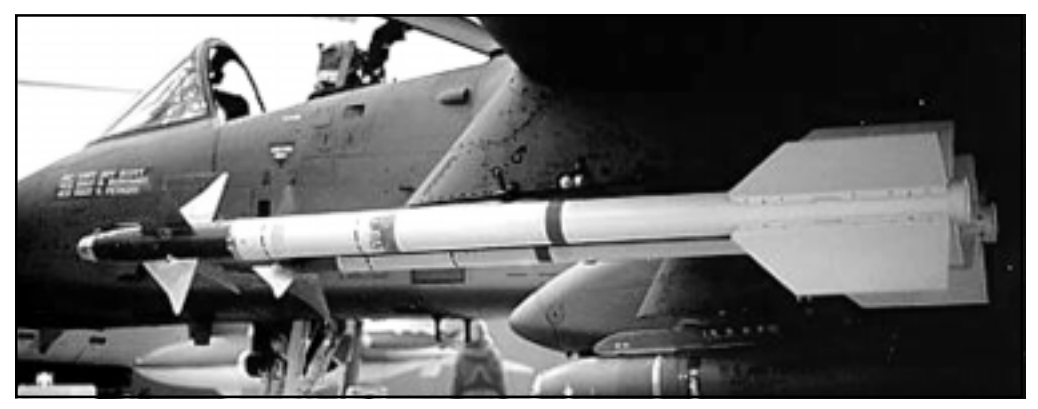
The introduction of the AIM-9 air-to-air missile provided a performance advantage that far exceeded its U.S. designers' expectations.

leveraging of reduced unit prices that is afforded by increased production quantities. Additionally, the DoD is seeking increased foreign participation in acquisition programs from the requirements definition phase through production, fielding, and life-cycle management. While these efforts have the potential to enhance interoperability, standardization, and commonality, reduce unit costs, and strengthen U.S. industry, they also risk making critical U.S. technologies vulnerable to possible exploitation.