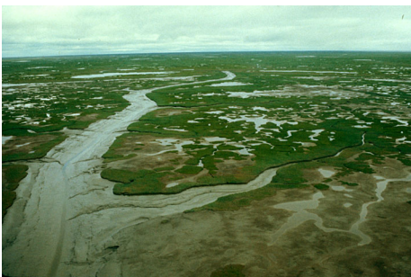
Izembek National Wildlife Refuge

Wetlands listed under the Ramsar Convention receive global recognition for their value as important habitat. Migratory species benefit because Ramsar identifies wetlands at an international level, with the possibility of sustaining their habitats and linking participating countries in a coordinated conservation effort. Communities enjoy enhanced tourism to well-publicized sites, and local property values have increased in proximity to Ramsar sites. There are 18 U.S. sites listed as follows: