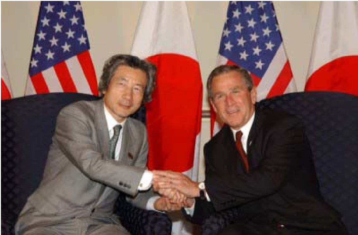
President Bush and Prime Minister Koizumi

"Rather than seeing foreign investment as a threat, we will take measures to present Japan as an attractive destination for foreign firms with the aim of doubling the cumulative amount of investment in five years."