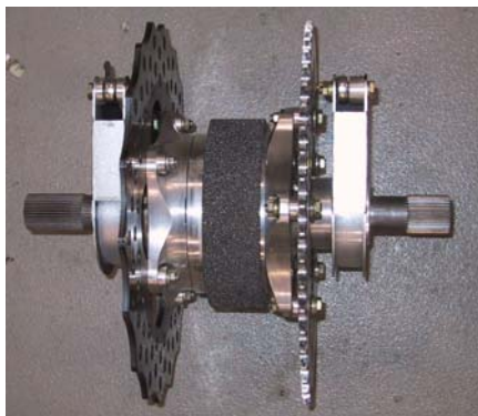
Foam bonded to outside of differential

The foam has been licensed to Poco Graphite, Inc. The company is commercializing the manufacture of the foam and can produce foam for large-volume applications. Additional licenses are available.