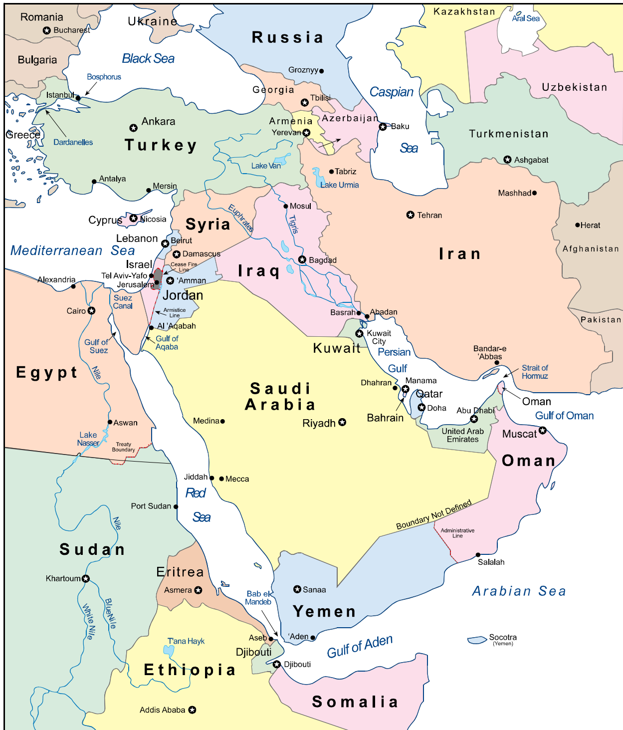
Adapted by CRS from Magellan Geographix. Used with permission.