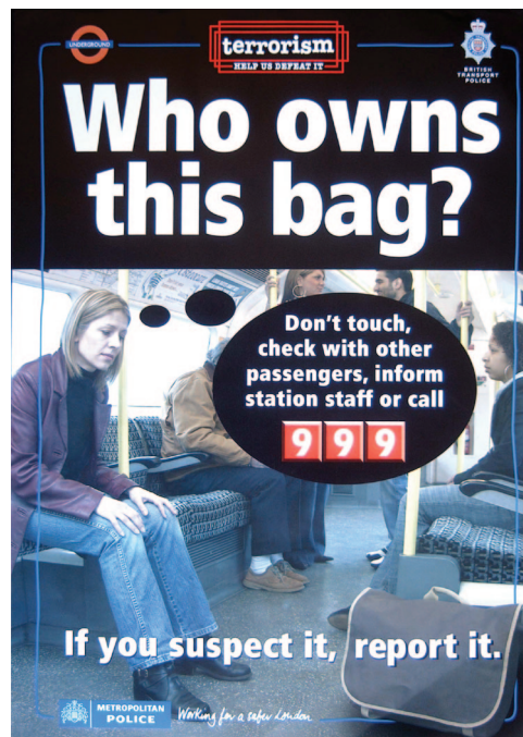
Figure 1: London Metropolitan Police Antiterror Alert Poster