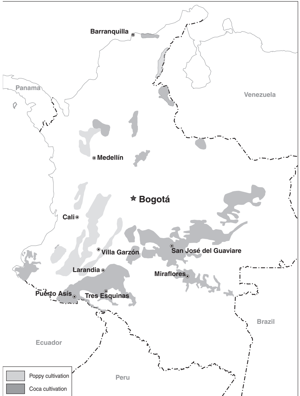
Figure 1: Coca- and Poppy-Growing Areas in Colombia, 2003