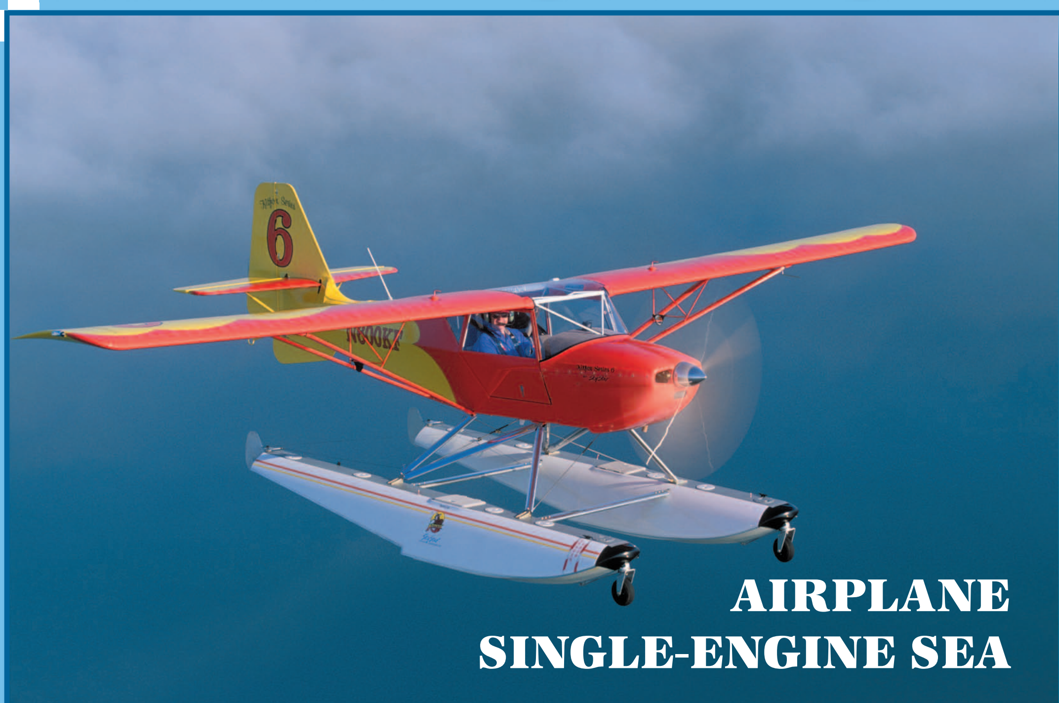
AIRPLANE SINGLE-ENGINE SEA