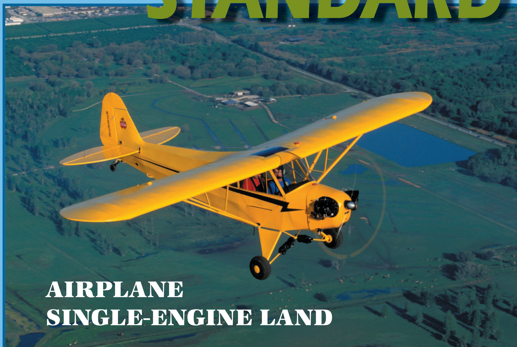
AIRPLANE SINGLE-ENGINE LAND