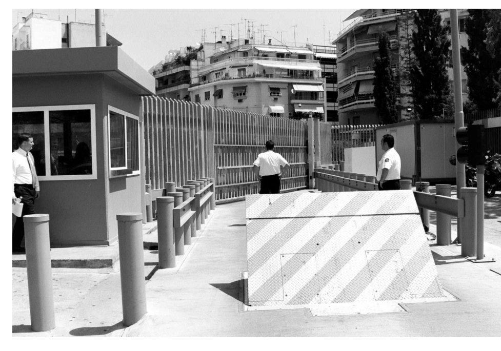
Figure 3: New Security Fence, Gate, and Vehicle Barrier at a U.S. Embassy