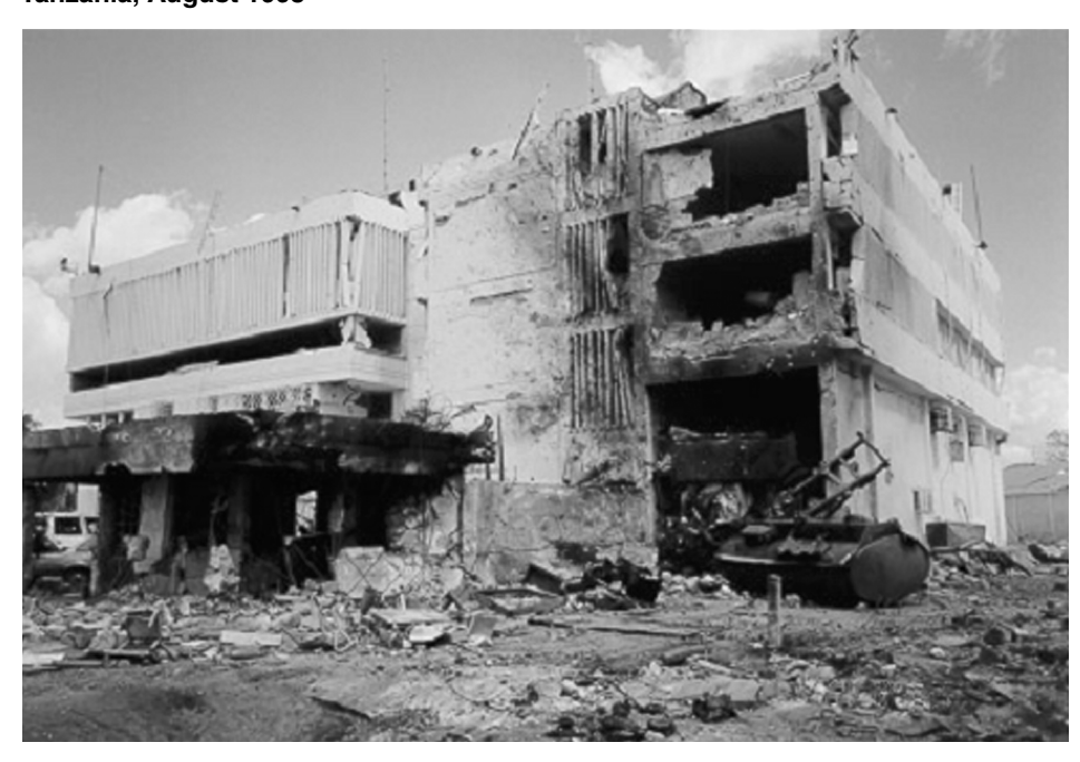
Figure 1: Damage from al Qaeda Terrorist Attack, U.S. Embassy, Dar-es-Salaam, Tanzania, August 1998